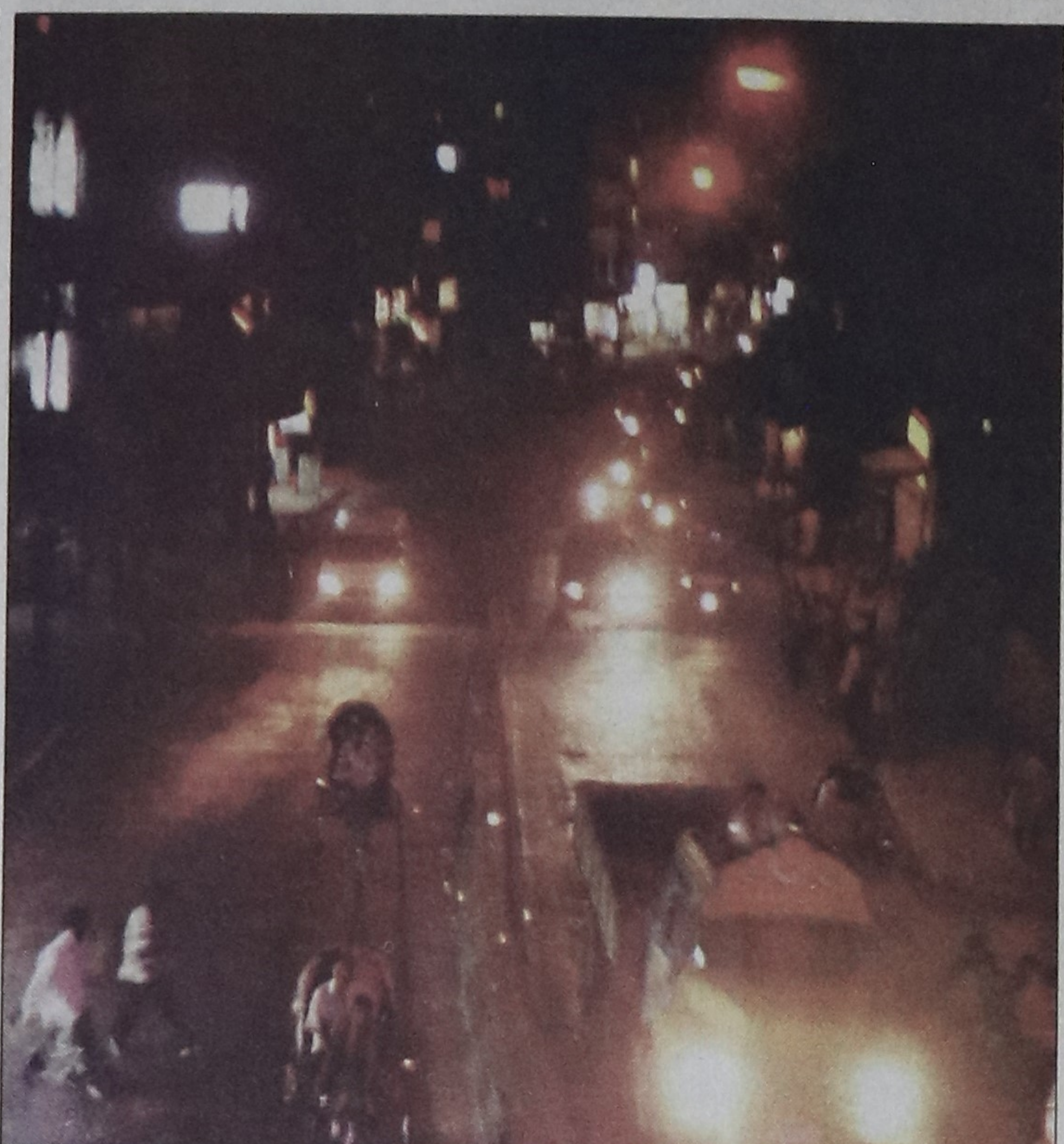
One side of the Hatkhola road is poorly illuminated with only two sodium lights, while the other is almost dark. The same is the story with every road in the capital city. Although the government claims more than 90 per cent of the sodium lights are operational, random survey has found a lot less. No wonder that muggers rule the dark corners.