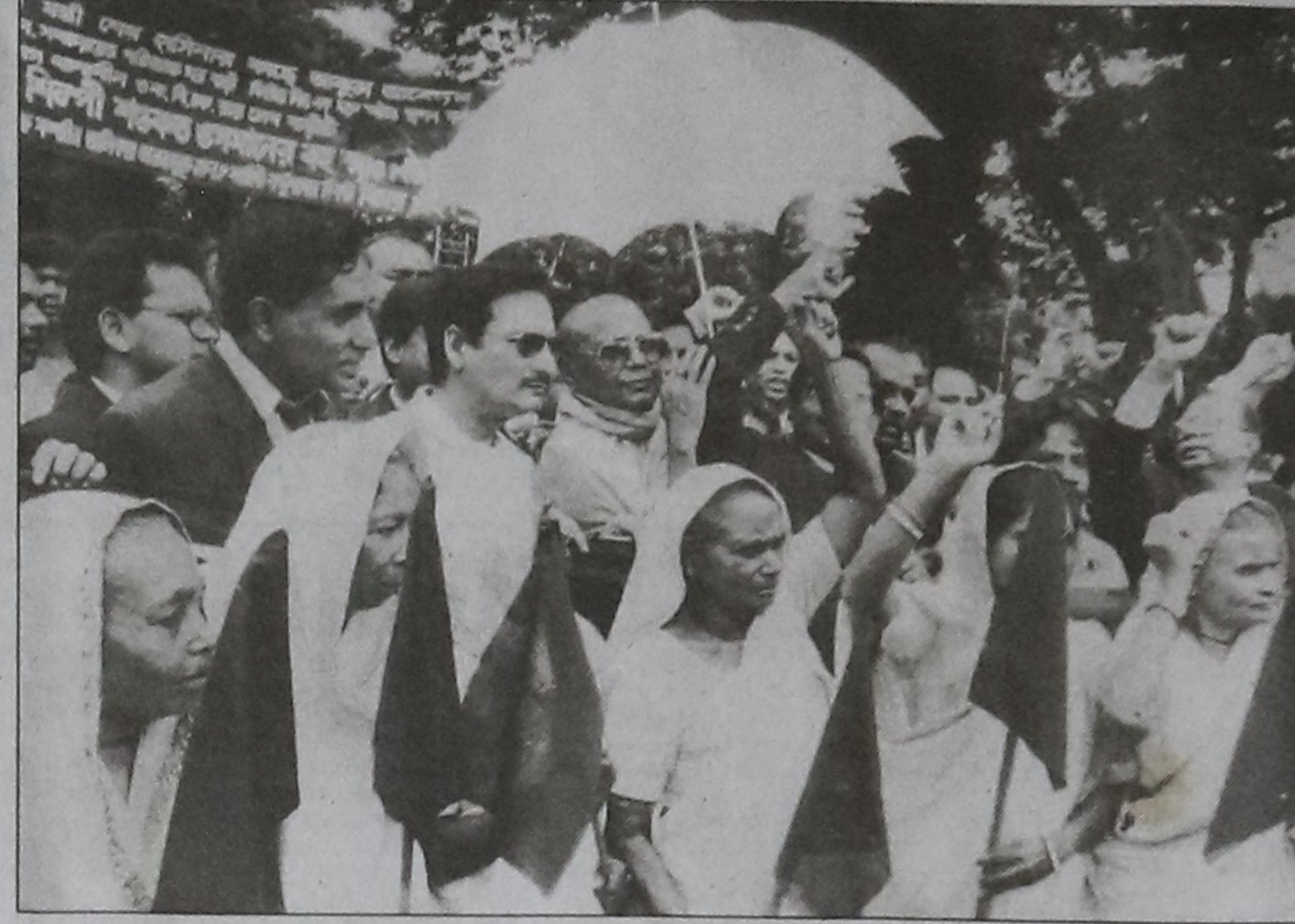
Members of the Hindu-Buddha-Christian Oikya Parishad took out a procession carrying black flags in the city yesterday. The Parishad is demanding repeal of the Vested Property Act in the current session of the Jatiya Sangsad.

In the second phase of three years, focus will be on training of local health personnel and rehabilitation of acid burn survivors.