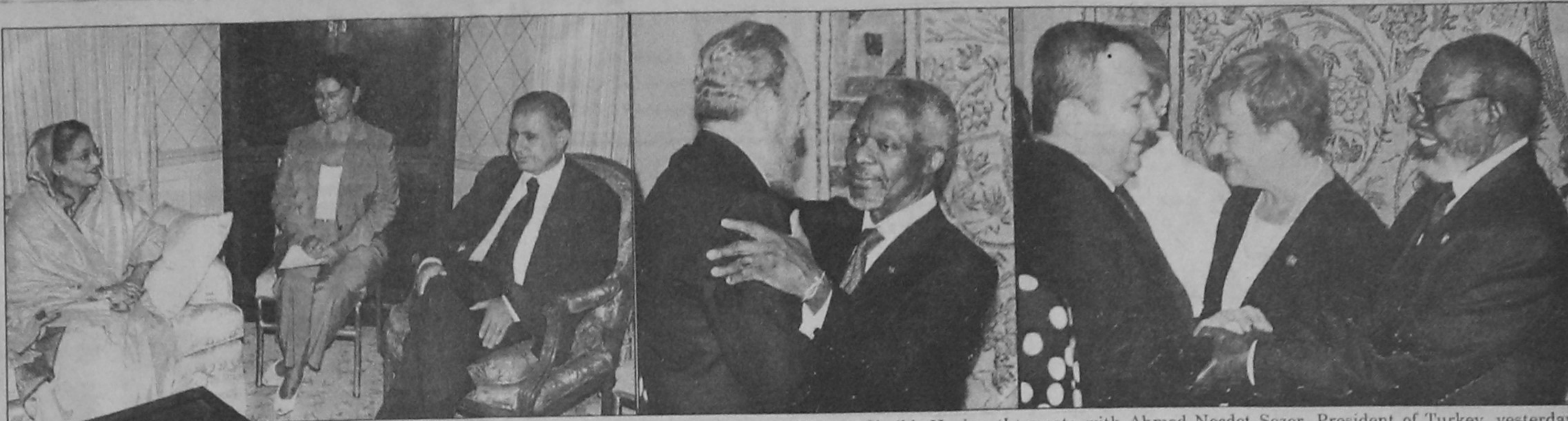
The UN Millennium Summit got underway yesterday in New York - pictures show Prime Minister Sheikh Hasina (L) meets with Ahmed Necdet Sezer, President of Turkey, yesterday morning at a hotel suite in New York while UN Secretary General Kofi Annan (M) greets Cuban President Fidel Castro, back at the UN after a long period. Picture on the extreme right shows Israeli Prime Minister Ehud Barak (L) shaking hands with Namibian President San Nujoma at the summit.