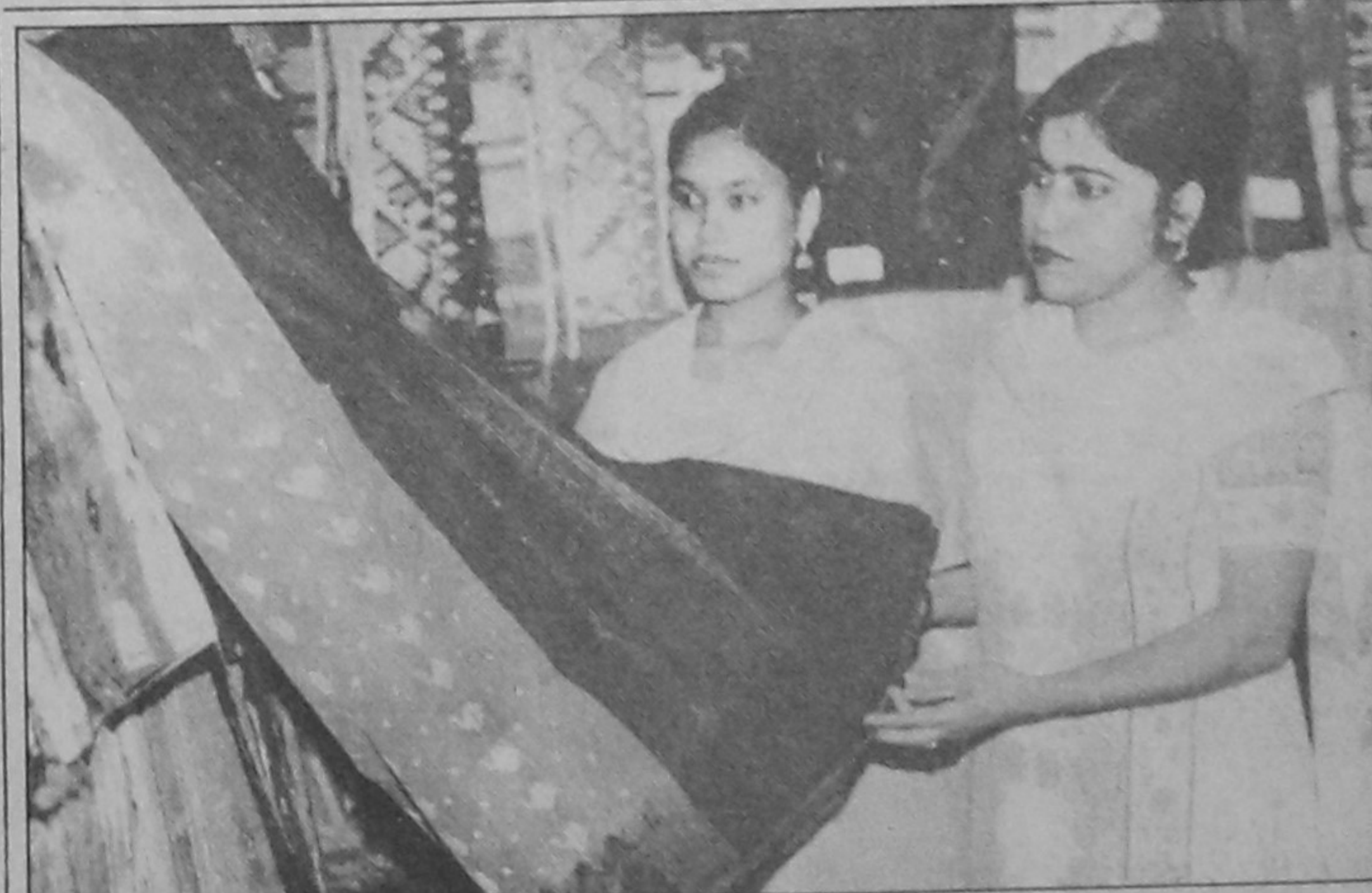
Visitors admiring Jamdani Sarees at the Sonargaon Jamdani saree exhibition going on in the city's Banani yesterday. The exhibition open till September 10, has been organised by Bangladeshi Sanjukta Tanti Samity.