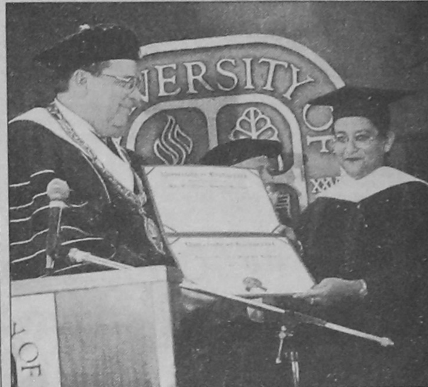
Prime Minister Sheikh Hasina was conferred the honorary degree of Doctor of Humane Letters at the University of Bridgeport in Connecticut, USA, on Tuesday.

However, security has been tightened in and around the city today with deployment of additional police force ahead of tomorrow's hartal.