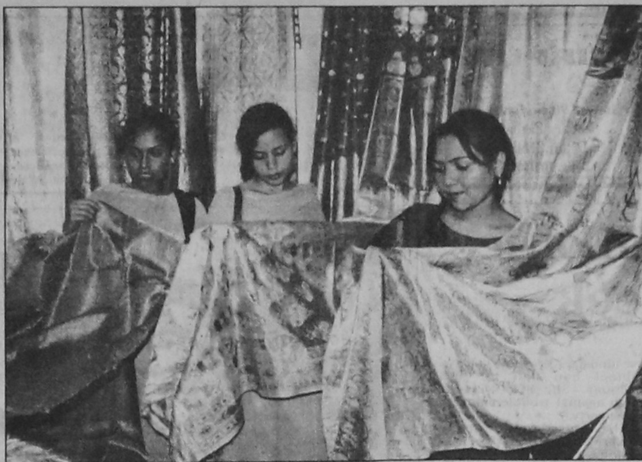
Visitors at an exhibition of Benarasi saree at the Property Plaza at New Circular Road in the city. Property Development Limited organised the show.

To mark the death anniversary, Milad Mahfil and Qurankhwani will be held at her Eskaton residence in the city and also at Deulagram Allahmanagar residence in Sylhet.