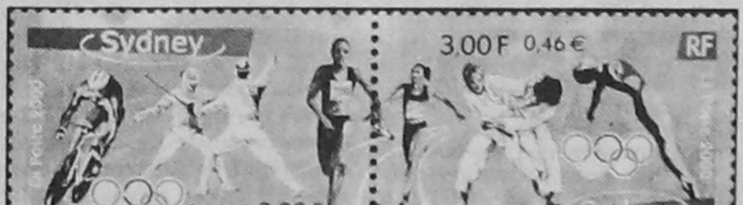
An AFP photo shows the reproduction of two stamps edited by French post office displaying athletes performing different sports for the Sydney Olympic Games.

"One cyclist suffered minor injuries," a police spokeswoman said.