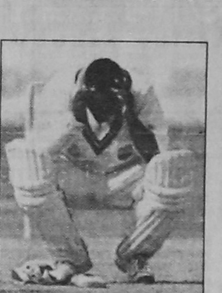
BRIAN LARA ... frustrated

"He will be a very good player, and I expect a lot from him. I think I will have a lot of