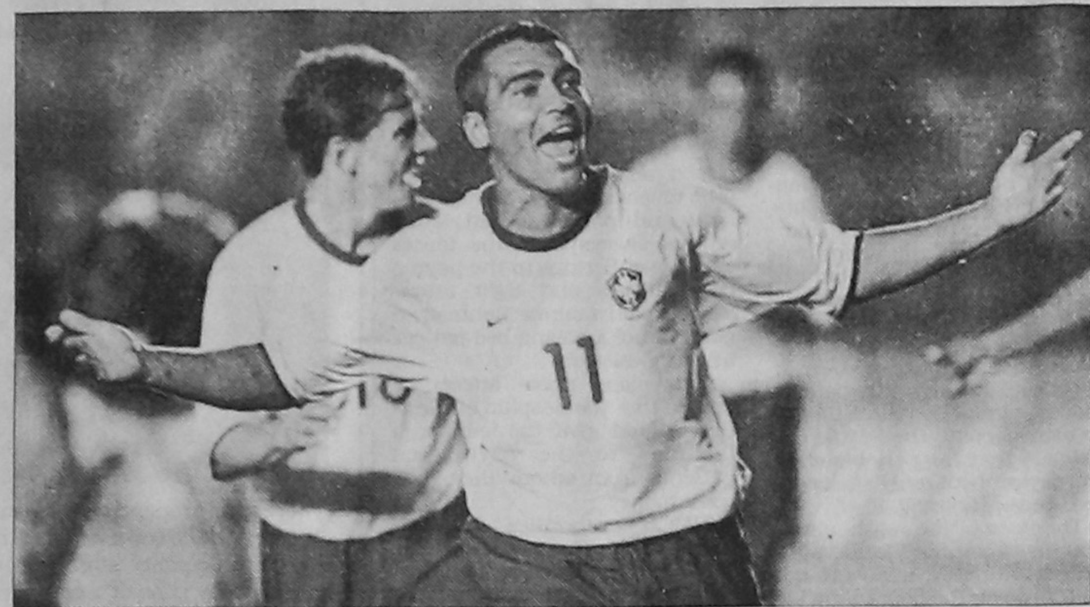
BACK WITH THREE BANGS! Brazilian superstar Romario (No 11) is ecstatic after completing his hat-trick against Bolivia in a World Cup 2002 qualifier at Rio de Janeiro on September 3.

Sanath Jayasuriya (captain), Marvan Atapattu (vice-captain), Avishka Gunawardena, Russell Arnold, Mahela Jayawardene, Kumar Sangakkara (wicketkeeper), Romesh Kaluwitharana (wicketkeeper), Chaminda Vaas, Nuwan Zoysa, Pramodya Wickremasinghe, Erik Upas-hantha, Muthiah Muralitharan, Upul Chandana, Kumar Dharmasena.