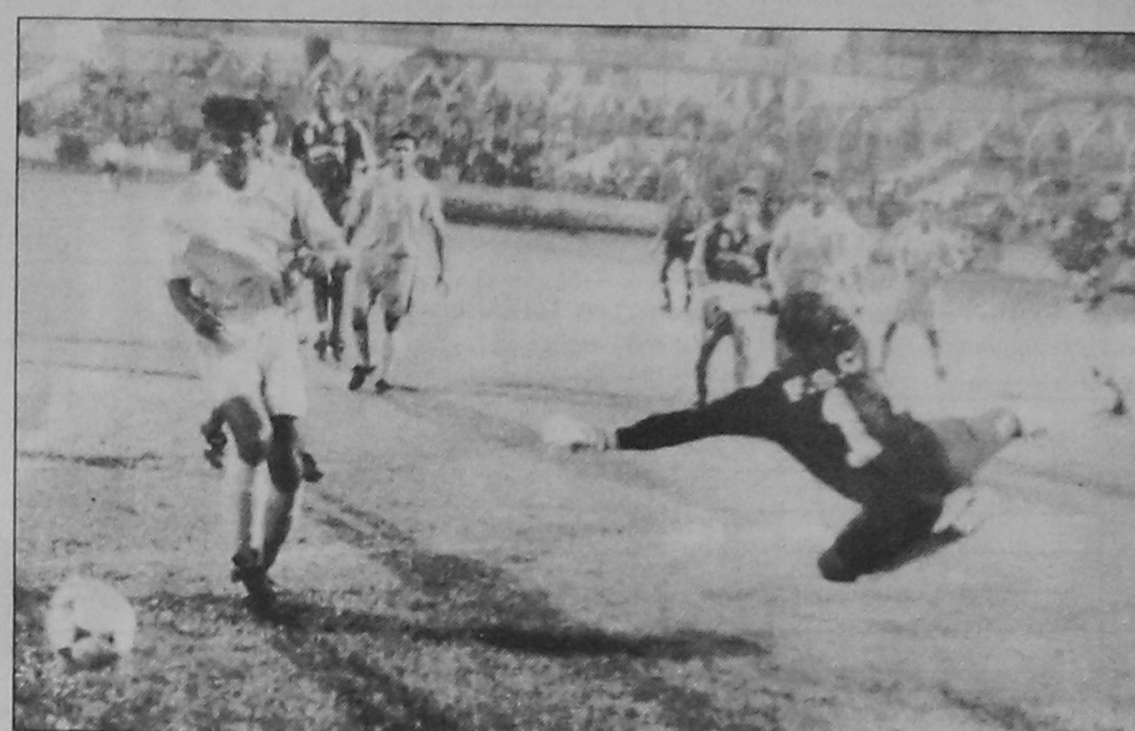
A goalmouth action from Premier Division football league match between Farashganj and Badda Jagorani at the Bangabandhu National Stadium last night.

Walsh, who is considering retirement after this series, began the day with 999 career overs bowled without a run being conceded. Ambrose, in his final Test, needed a 10th, in his second spell of the day, to become the seventh member of a club which also includes spinners Derek Underwood (1239), Shane Warne (1193) and Bishen Singh Bedi (1096). The only other pace bowler in the line-up is India's Kapil Dev (1060), whose Test wicket record of 434 Walsh passed in April. Leading the band, with 1315 maidens is West Indian off-spinner Lance Gibbs.