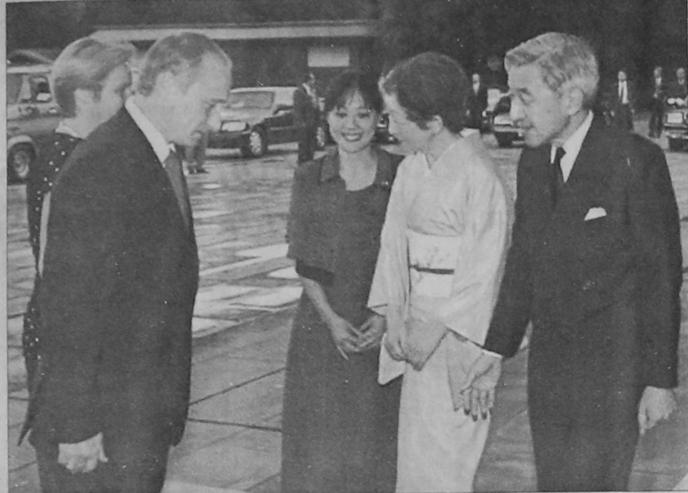
Russian President Vladimir Putin (L) and his wife Lyudmila (L, background) meet Japanese Emperor Akihito (R) and Empress Michiko (2nd R) in front of the Emperor's palace yesterday. Putin arrived in Japan on three-day official visit.

Police discovered the explosives were intended for terrorist attacks in India. The last haul of RDX in Nepal, two years ago, totalled 19 kilos, also found at a hotel in Kathmandu.