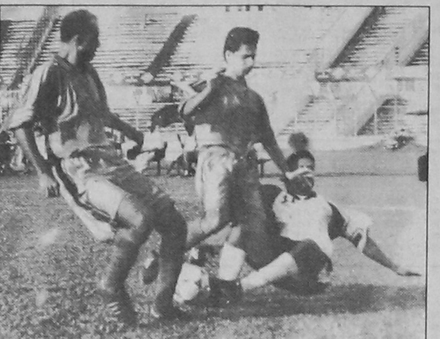
Action from the Premier Division Football League match between Brothers Union and Arambagh at the Bangabandhu Stadium yesterday.

Premier Division Badda Jagarani v Farashganj SC (6 pm) First Division Shantinagar Club v Agrani Bank (4 pm) (Venue: Bangabandhu National Stadium)