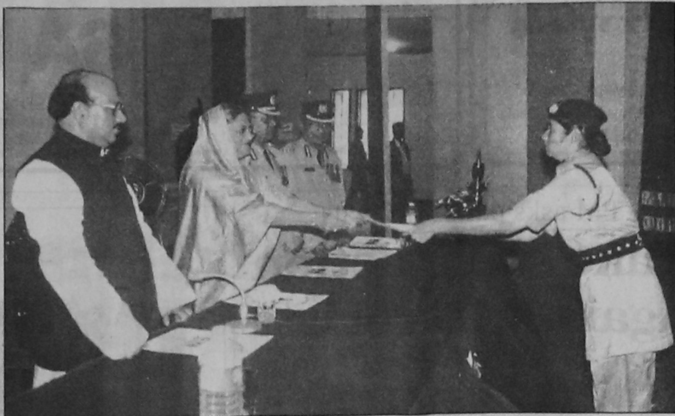
Prime Minister Sheikh Hasina giving out certificates at the passing out ceremony of the trainee Assistant Police Supers (APSPs) of the 18th BCS batch at Chemney Memorial Hall at Sharda Police Academy in Rajshahi yesterday.

The programme will begin tomorrow at Banani. The programme includes recitation from Quran, zikir , milad-mahfil , fatehas , hifaz prayers and uaz nashit .