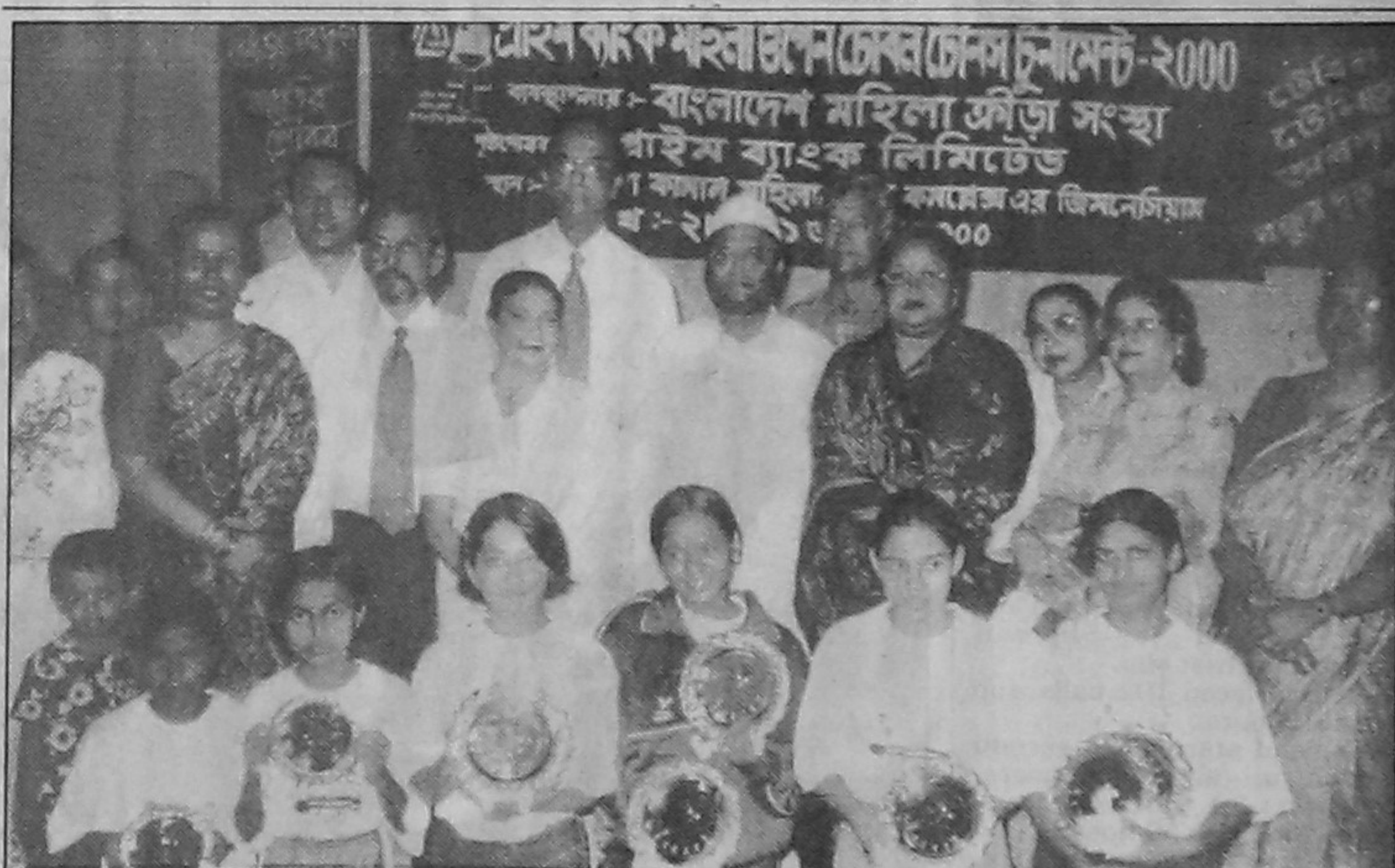
Winners in the Prime Bank Women's Open table tennis championship along with the guests and officials during the closing-ceremony at the Sultana Kamal Women's Sports Complex yesterday.