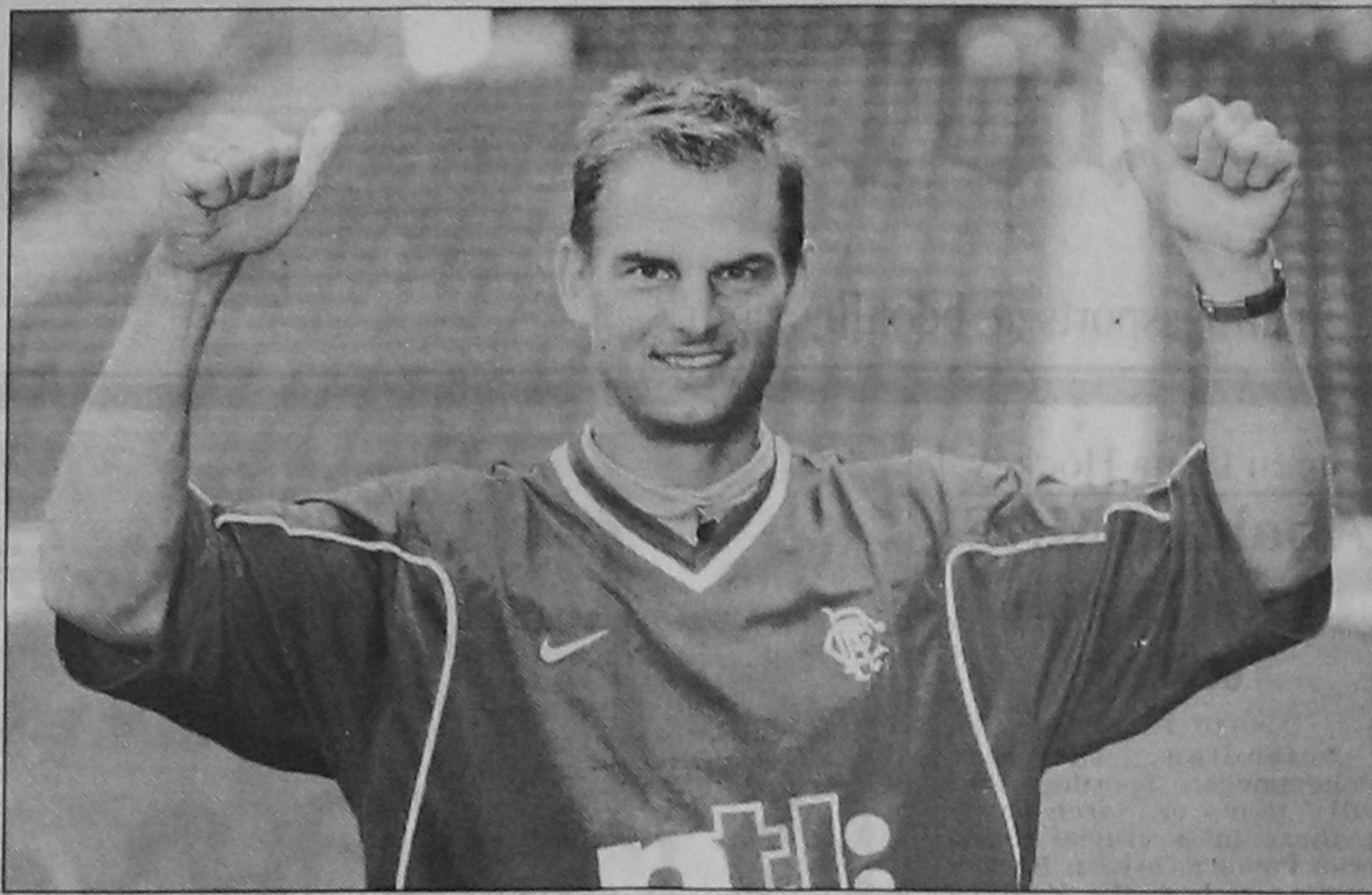
Frank de Boer, the Dutch international playmaker, poses for photographers with the jersey of his new club Glasgow Rangers on at the Ibrox Stadium on August 30.

That leaves Michael Owen, Andy Cole and teenager Alan Smith — who was called into the squad earlier this week as an emergency replacement for Emile Heskey — as the only fit strikers left in the England party.