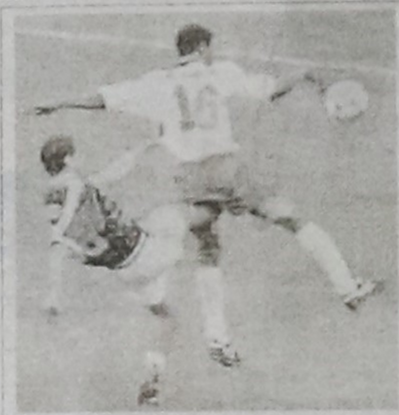
Football at 7.50 am

Notice: Today's prescheduled magazine programme "So you want to be a millionaire while holding the top post" has been postponed as the programme host HM Thistaste was taken to the prison abruptly yesterday