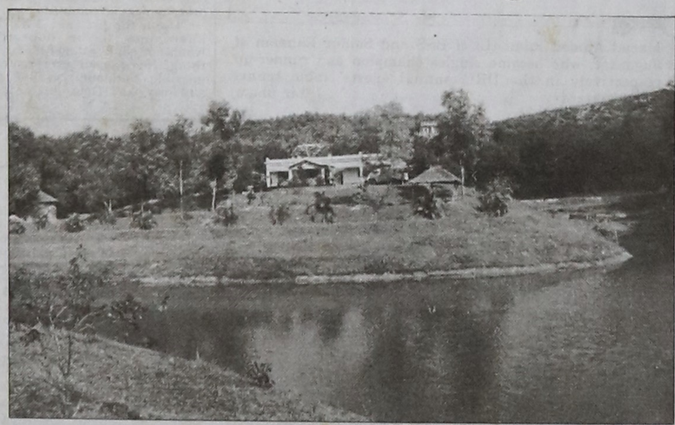
Khonika, the lone picnic spot in Jamalpur, needs development so that more tourists from home and abroad visit the place.

Kornajhora a hilly fountain is flowing with gentle murmur from the slope of Garo hill. Chirping of unknown birds and the beautiful scene green forest have made the environment really soothing. Some times herds of wild pigs and elephants