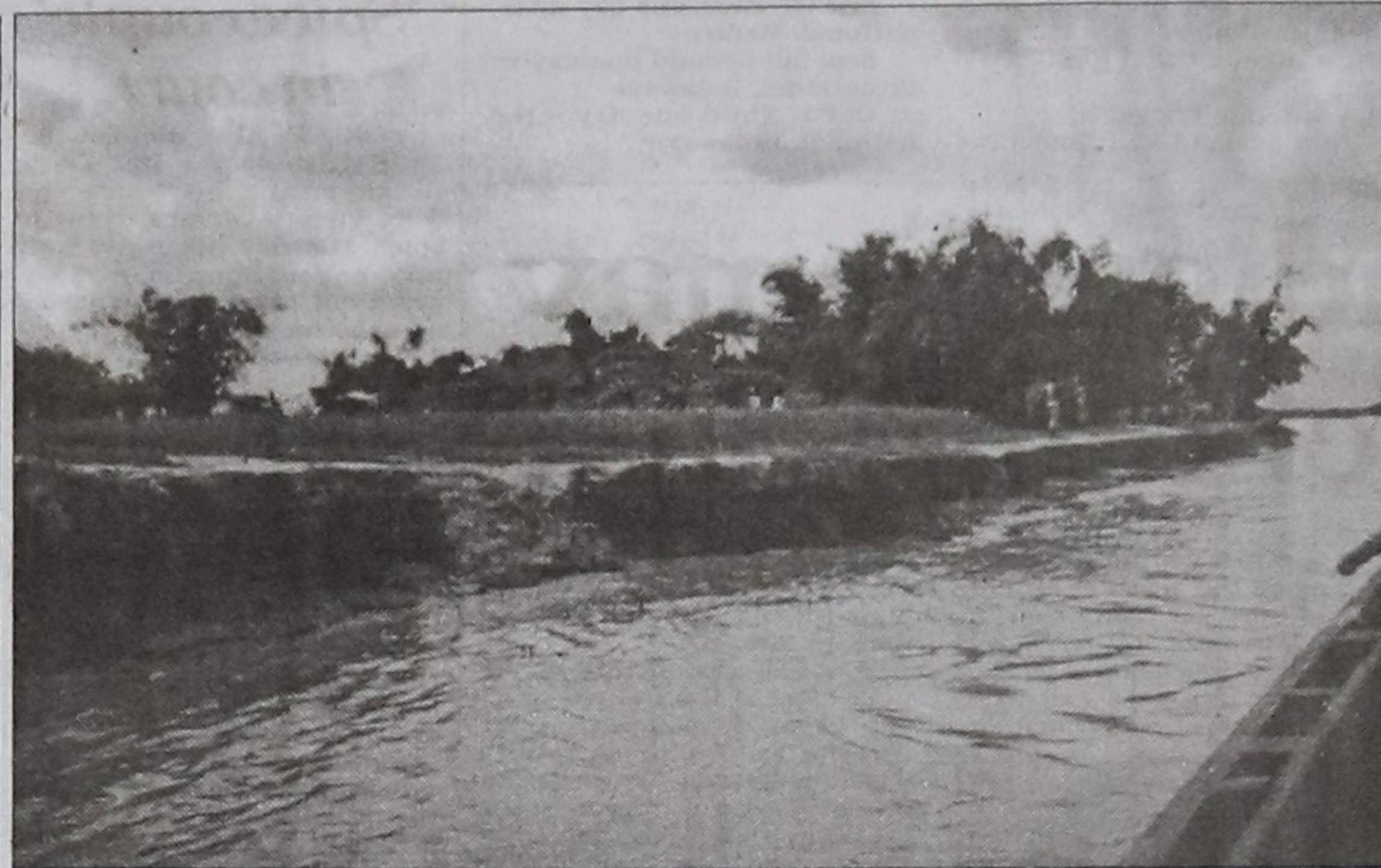
With the recession of water level erosion by the River Padma takes an alarming turn in Daulatpur upazila in Kushtia district. The river devoured some one thousand dwelling houses in the last 20 days in the upazila, rendering about 8,000 people homeless.

"Though it is not certain at all, but we hope the project will be approved by early next financial year," said Abu Salek.