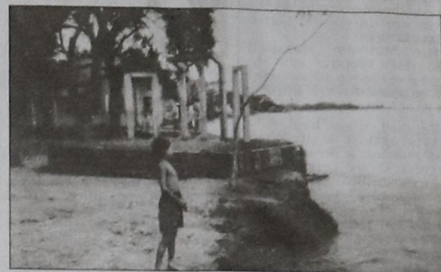
The River Brahmaputra is about to devour the Shaheed Minar of Kamarjani High School in Gaibandha district.