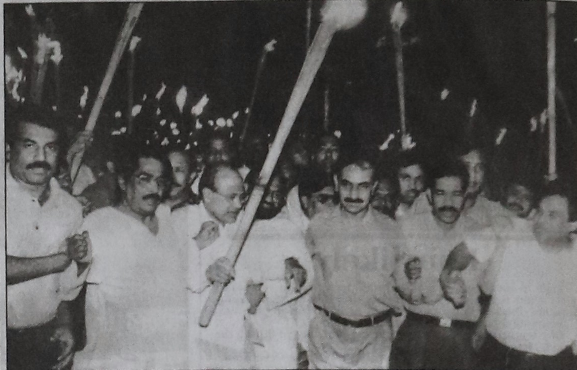
BNP brought out a torch procession in the city yesterday in support of today's hartal. The opposition alliance has called the country-wide shutdown protesting price hike of petroleum products and oil and filing of false cases against their activists.

When contacted, an office-bearer of FBCCI said licence of the trade bodies are issued by Ministry of Commerce and FBCCI allows memberships making them eligible for voting.