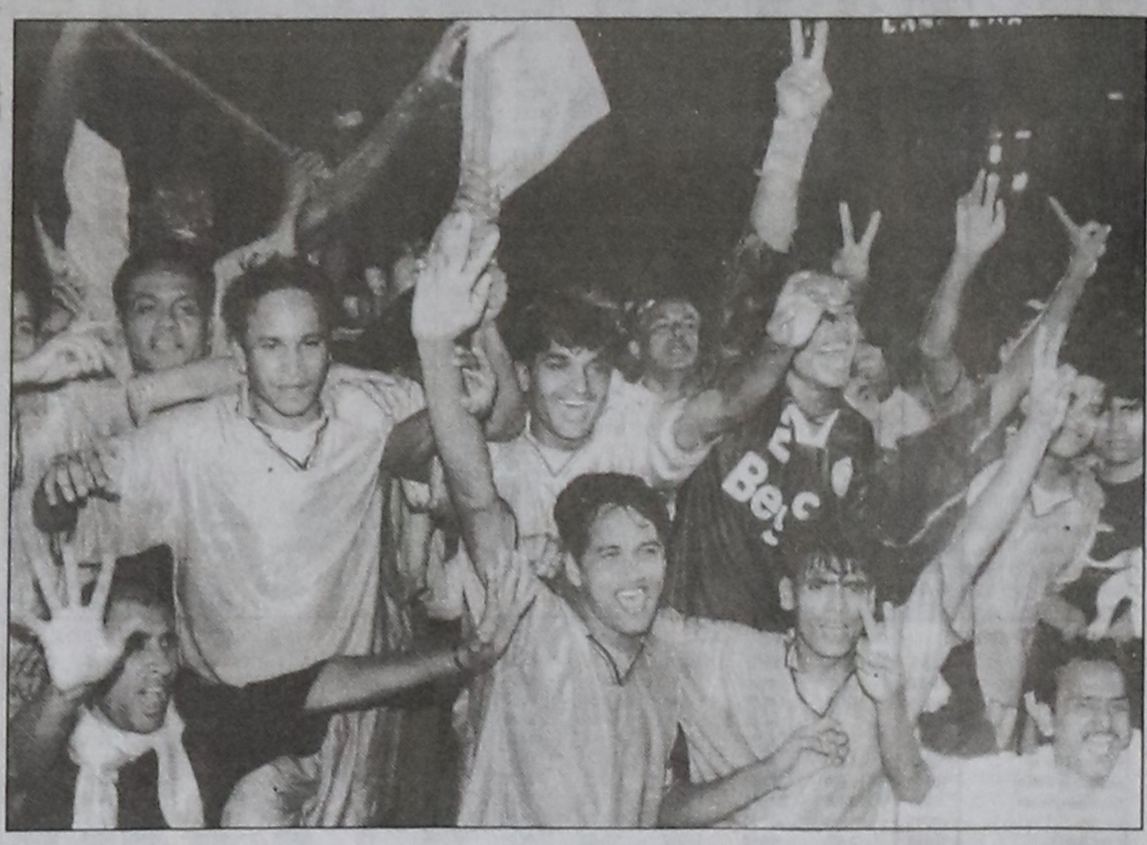
OVER THE MOON! Ecstatic Abahani players and officials after their victory in the Federation Cup final.

WASHINGTON, Aug 28: The head of security for the Sydney Olympics said today a reported plot to blow up Australia's only nuclear reactor during the Games had been exaggerated and he did not think there was any threat, reports Reuters.