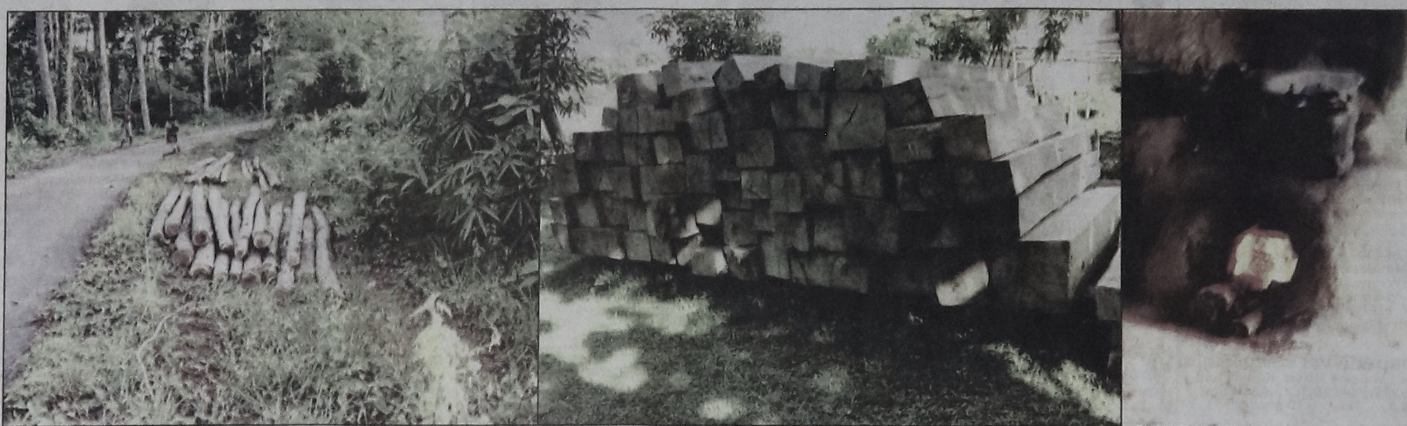
Remains of a teak plantation of Forest Department at Baghaichhari in Rangamati: an illegal harvest of logs lies on the roadside for shipment (left), stacks of seized timber at Baghaichhari forest office (middle) and logs fuel the fire in the clay oven in a tea shop at Baghaichhari bazar (right). (Story on page-1.)

Published by the Editor from Transcraft Ltd, 229, Tejgaon Industrial Area, Dhaka-1208 on behalf of Mediaworld Ltd., 52 Motijheel C.A., Dhaka-1000. Editorial, News & Commercial Offices: 19 Karwan Bazar, Dhaka-1215. Telephone Numbers: 8124944, 8124955, 8124966, Fax: 8125155, GPO Box No: 3257, Cable: DAILYSTAR, DHAKA. Internet edition address: http://www.dailystarnews.com and Email address: dstar@bangla.net