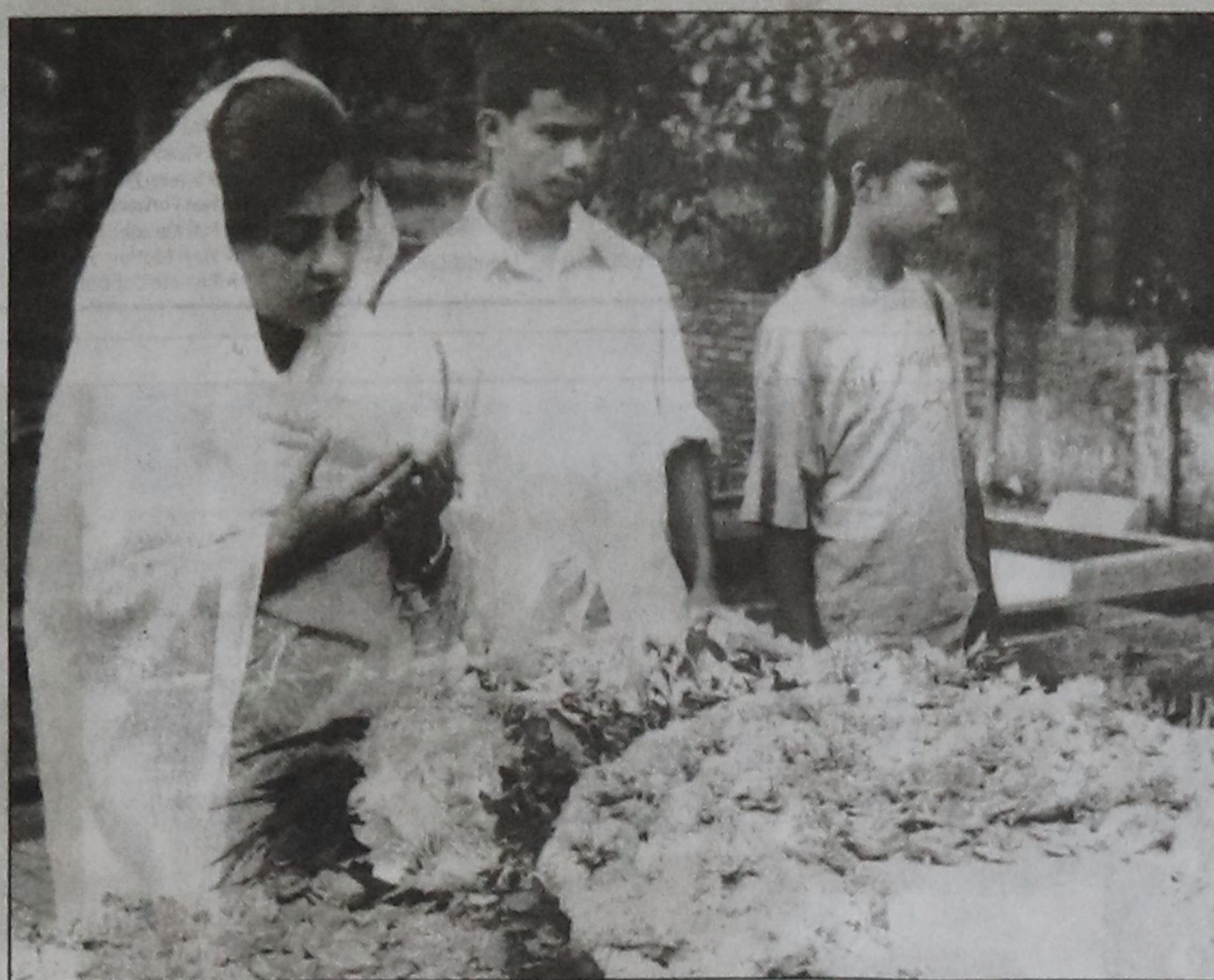
Members of poet Kazi Nazrul Islam's family placed wreaths at his grave on the Dhaka University campus yesterday on the occasion of the poet's 24th death anniversary.

Over 60 prominent personalities from various public and private organizations, educational institutions, NGOs and professionals took part in the workshop.