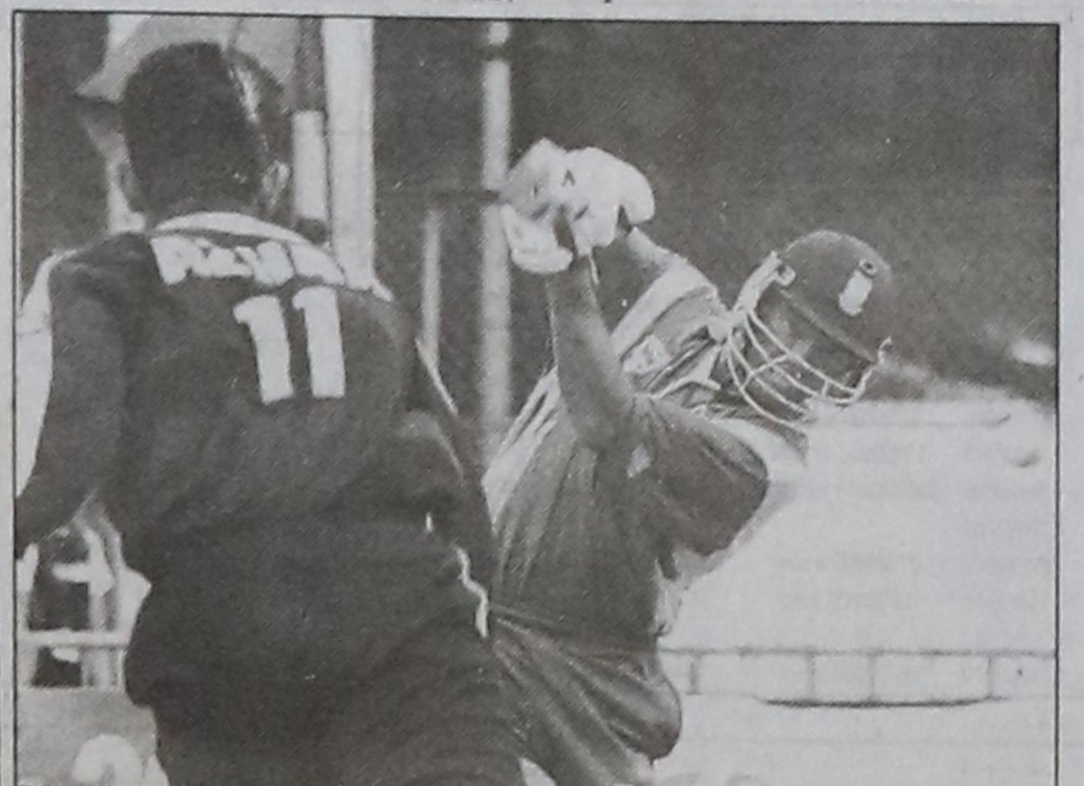
South Africa's Nicky Boje, who was later adjudged man-of-the-match, follows through on a drive against Pakistan's Azhar Mahmood during the Singapore Challenge 2000 final yesterday.

"In the past few years we've played badly in finals, so it's nice to play well when it really counts," South African captain Shaun Pollock said, singling out the Kirsten-Boje partnership as crucial to their win.