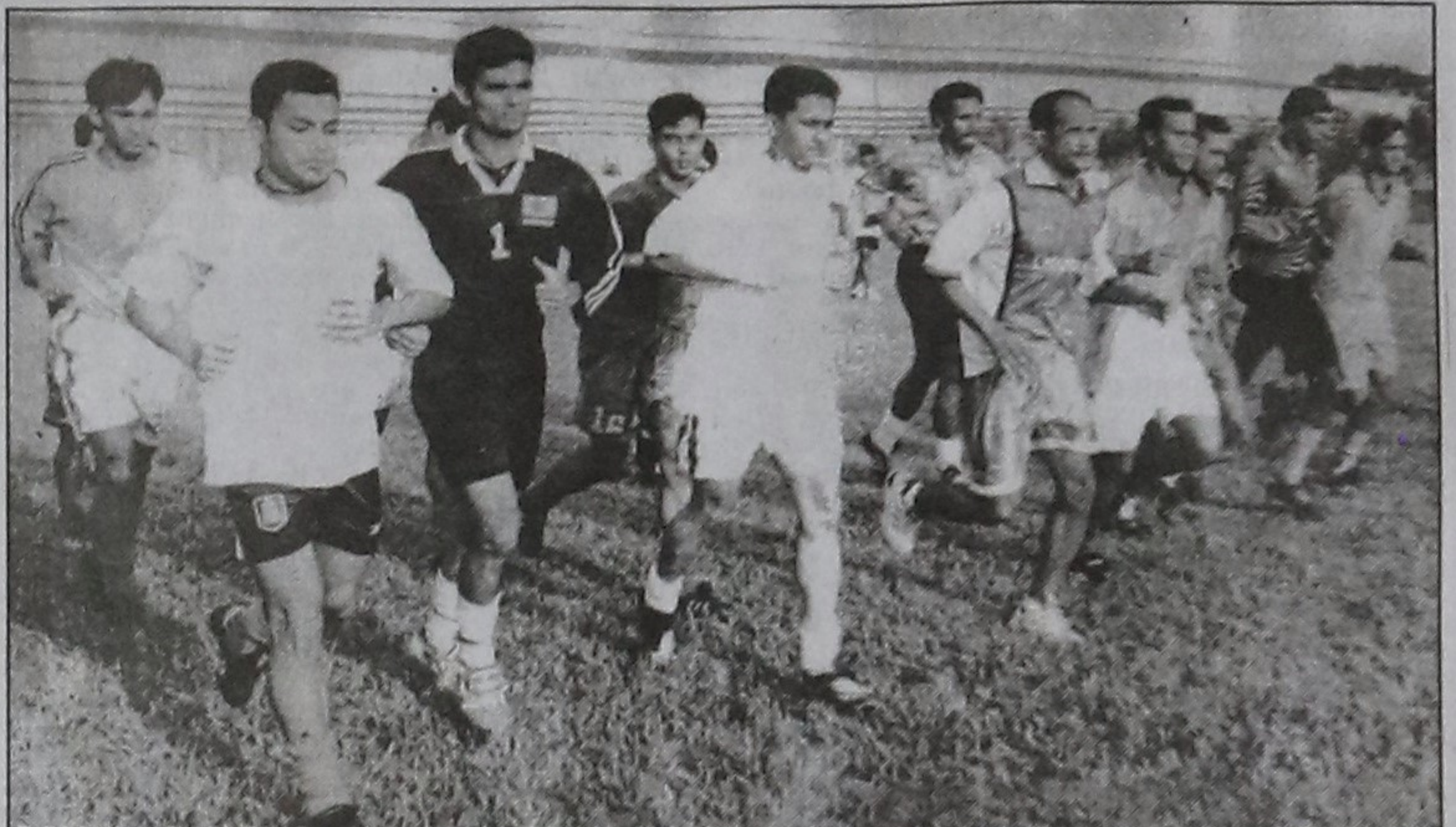
Players of Muktiyoddha Sangsad warm up during a practice session yesterday.

Majid rejects benefit offer KARACHI, Aug 25: Former Pakistani captain Majid Khan on Friday refused an offer of financial benefit from an October series between Sri Lanka, India and Zimbabwe, reports AFP. "I have played cricket for my country and not to take reward from any other country," Khan told this news agency. The Cricketers' Benefit Fund Series (CBFS) in the Gulf emirate of Sharjah has given a total of 35,000 dollars in payouts to former cricketers, mainly from Pakistan and India, over the last 20 years. The Pakistan Cricket Board (PCB) in July nominated Khan and fast bowler Sarfraz Nawaz as beneficiaries for October's tri-series. The CBFS approved the nominations last month. Nawaz has accepted the offer and will go to Sharjah to receive the benefit cheque. Khan, also a former PCB chief executive, said he had been nominated without his consent. "I had announced my name without even taking my consent. Even otherwise I would not have accepted the offer," he said.