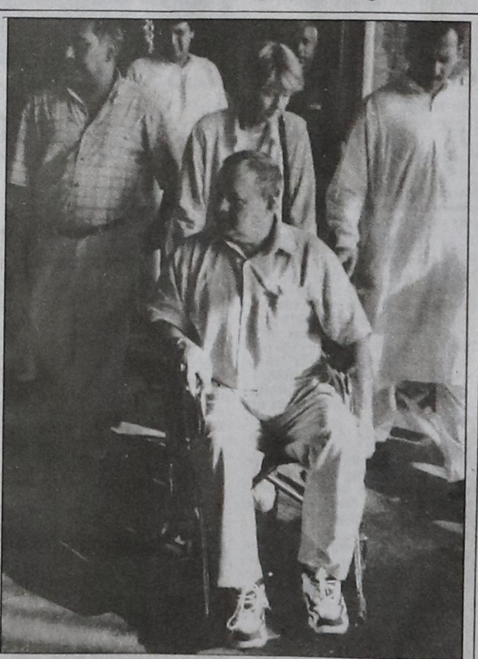
WELCOME BACK: Bangladesh Cricket Board's director of coaching Eddie Barlow coming out of Zia International Airport in a wheel chair yesterday.