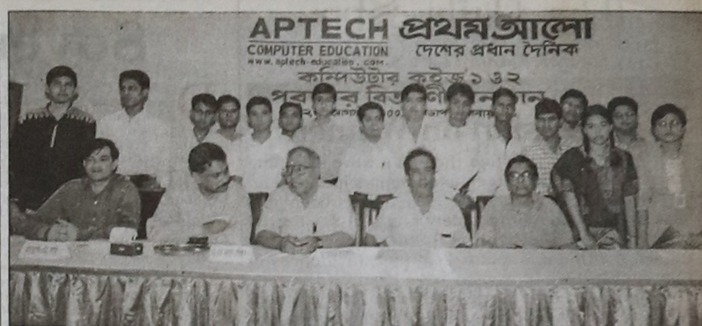
The winners of Apteck-Prothom Alo Computer Quiz 1 and 2 competition seen at the prize distribution ceremony held in the city recently.

The JU unit of JCD will bring out a mourning procession from the Arts Faculty at 11:00 am which will march through the campus, and end at the university central cafeteria. Besides, JCD has arranged a milad mahfil at the university Central Mosque after Zohr prayers.