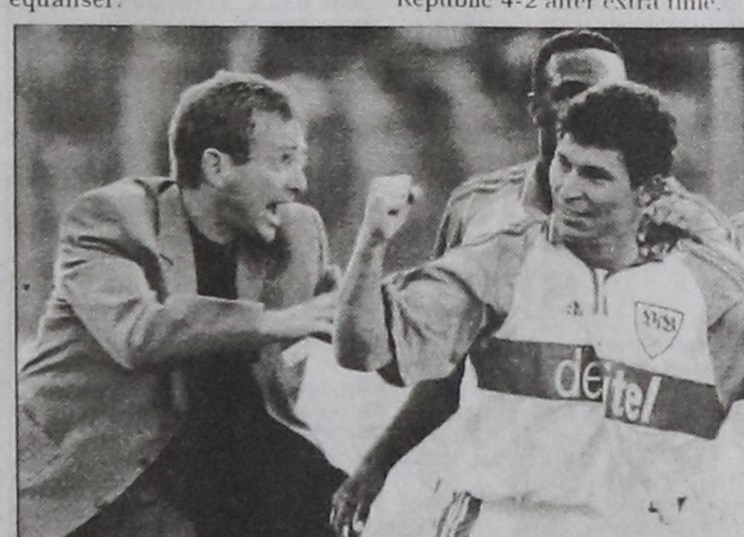
VfB Stuttgart's Bulgarian star Krassimir Balakov (R) being congratulated by an ecstatic team coach Rolf Rangnick after scoring against AJ Auxerre during their Intertoto Cup fixture at Stuttgart on August 22.

Italian outfit Udinese qualified 6-4 on aggregate after beating Sigma Olomouc of the Czech Republic 4-2 after extra time.