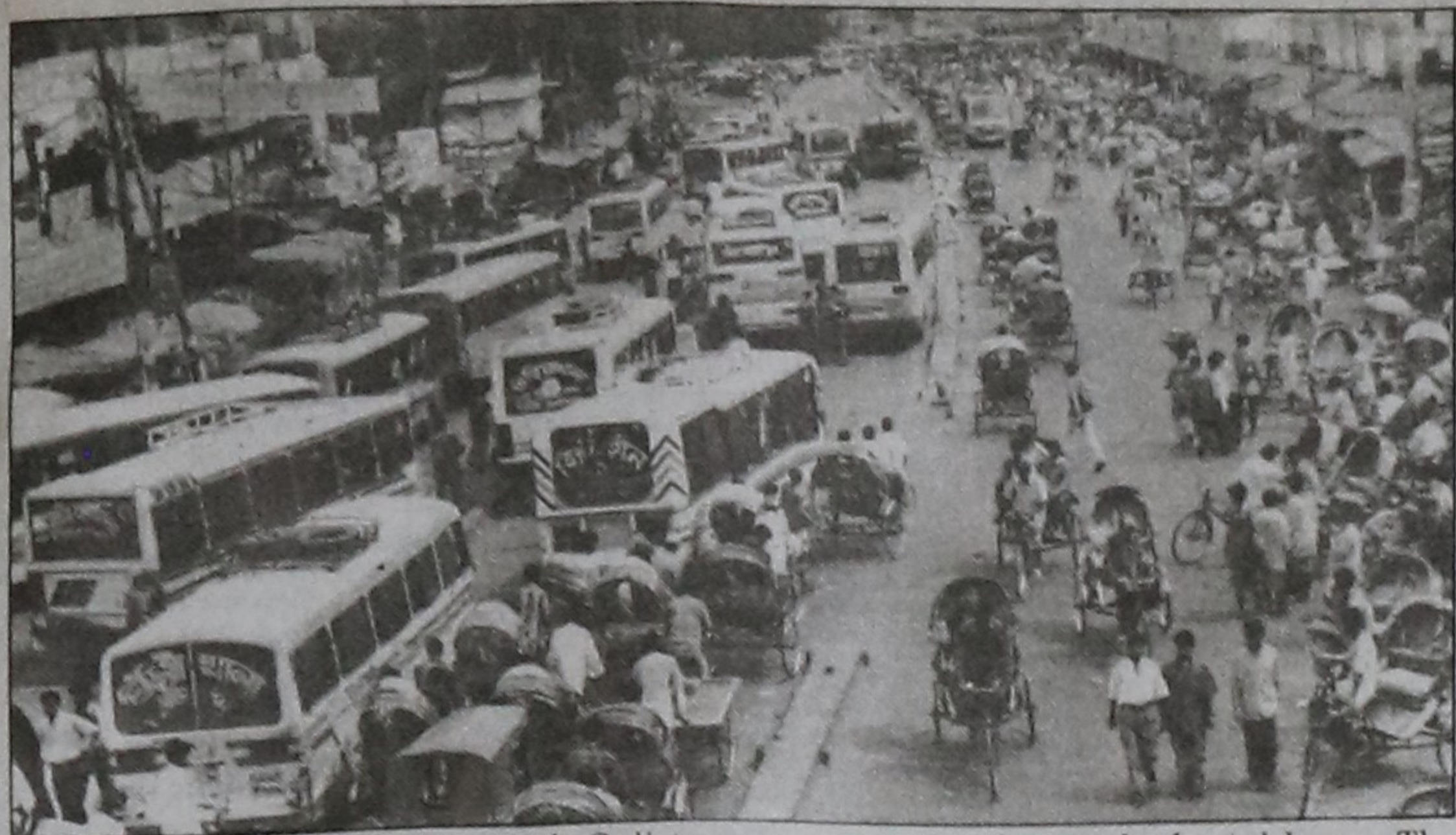
Buses seen plying as usual at city's Gulistan area yesterday during the hartal hours. The half-day country-wide shut-down was called by the four-party opposition alliance.

The 7-day-long exhibition will remain open from 2:00 pm to 8:00 pm everyday till August 30, the release said.