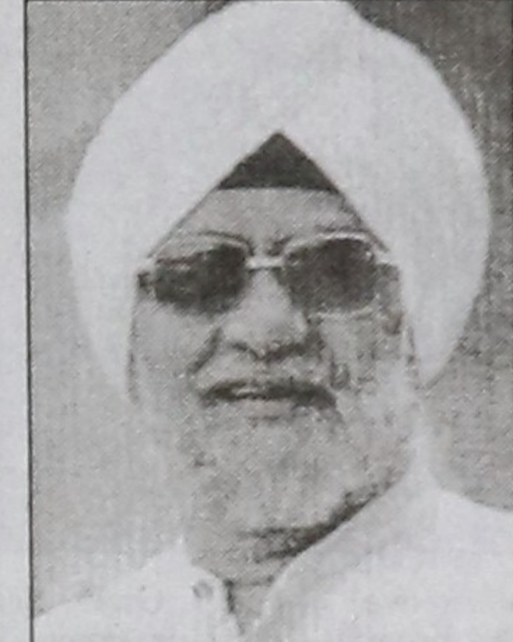
BISHEN SINGH BEDI

But some top names in cricket say the code will not deter match-fixing and treats