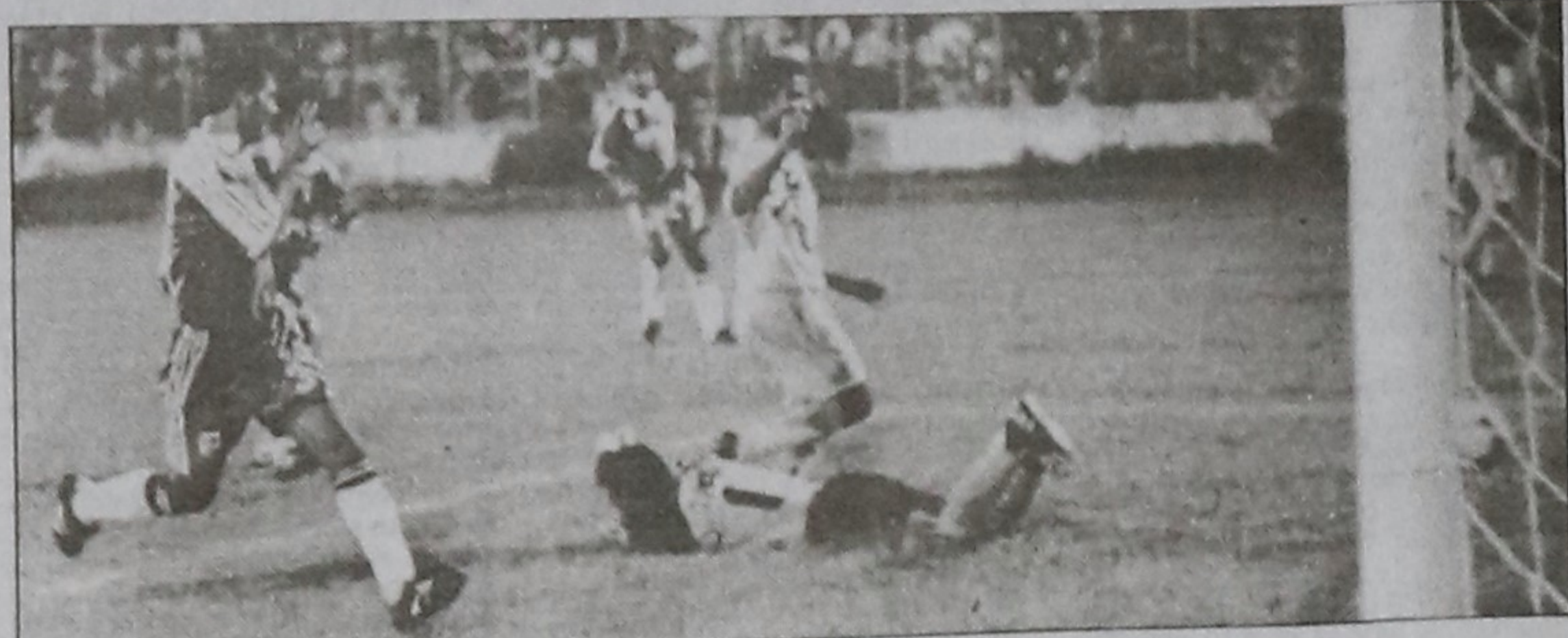
An Abahani attack on the Badda Jagorani goal during their Federation Cup clash at the Bangabandhu National Stadium yesterday.

The duo helped their side recover from just eight for three to close on a more impressive 231 for five off 64 overs in this Division Two encounter.