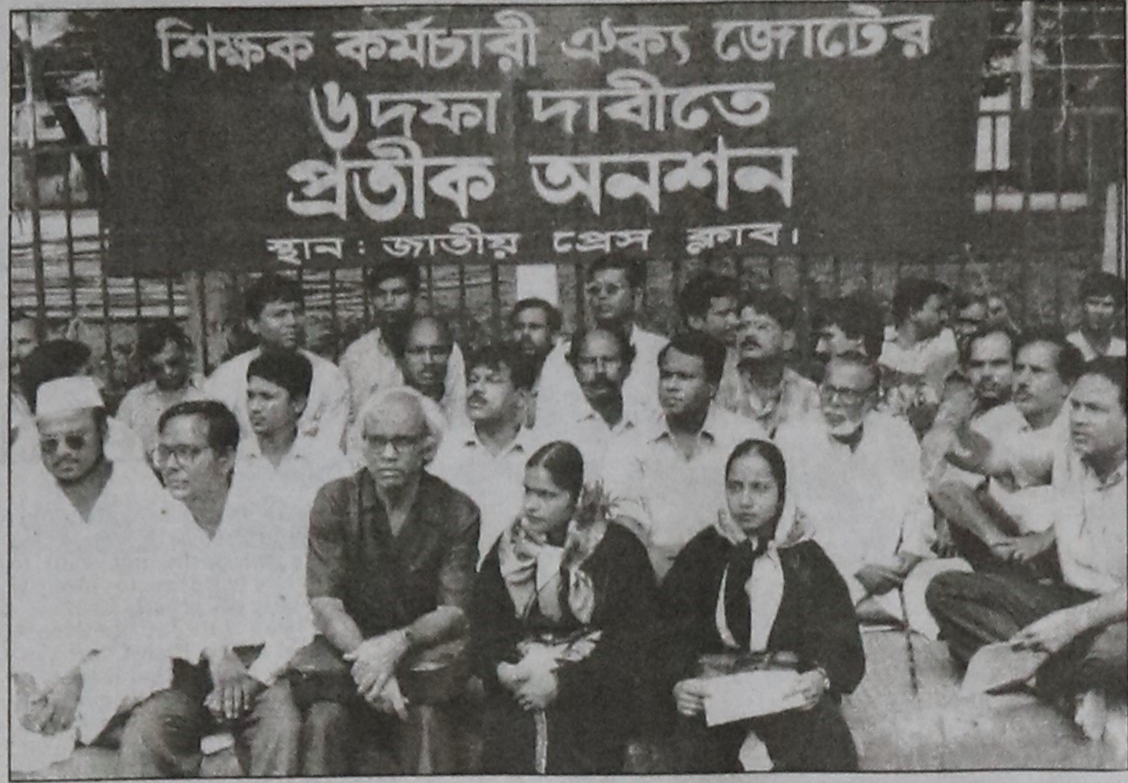
Shikhhak Karmachari Oikya Parishad staged a token hunger strike in front of the National Press Club yesterday to press for its 6-point demand.