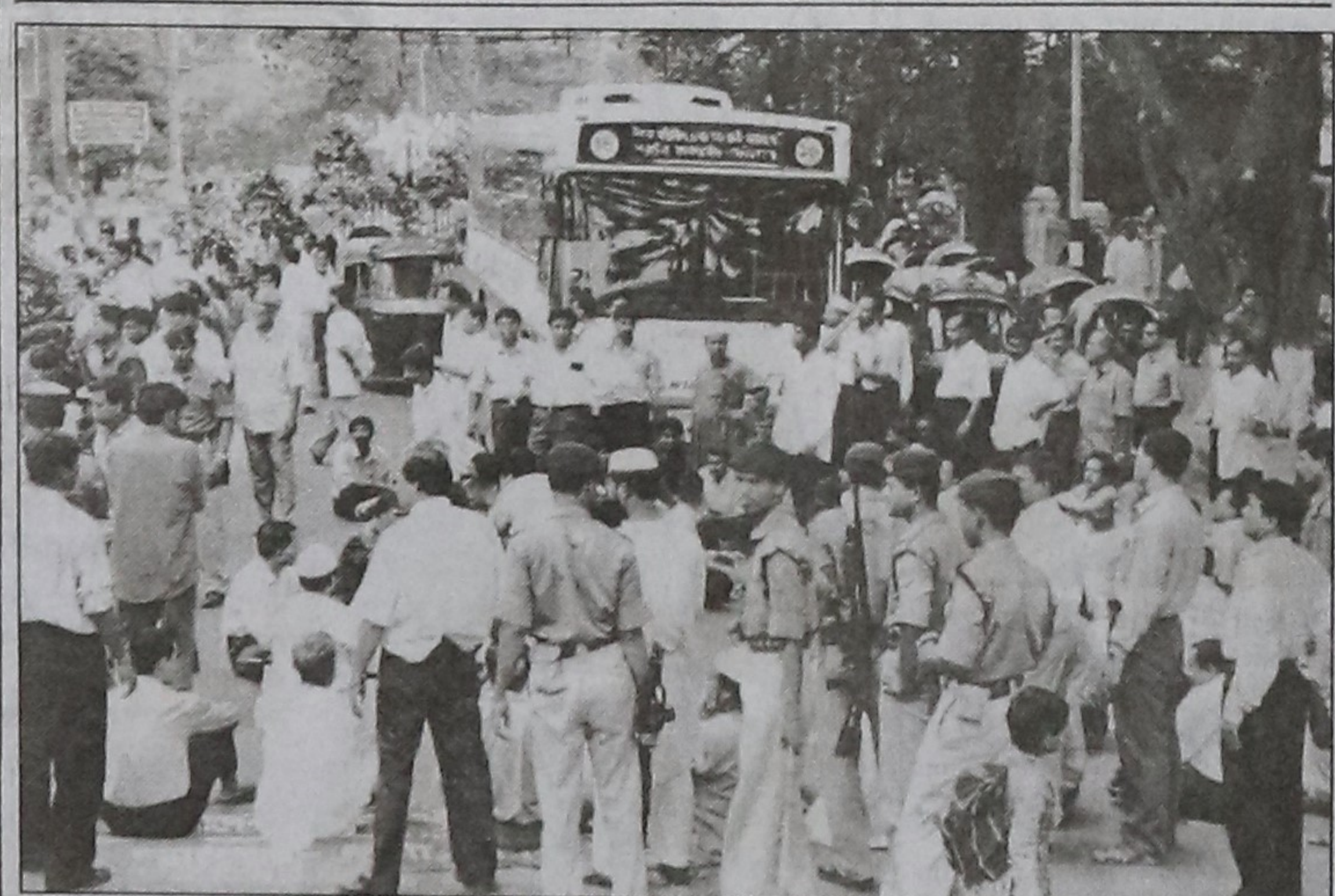
Teachers and employees of non-government schools and colleges staged a sit-in on the road in front of the Shikha Bhaban yesterday, disrupting traffic for an hour. They have been agitating to press their six-point demand including 100 per cent salary from the public exchequer since July 10.

Eight persons were accused in the case filed in this regard.