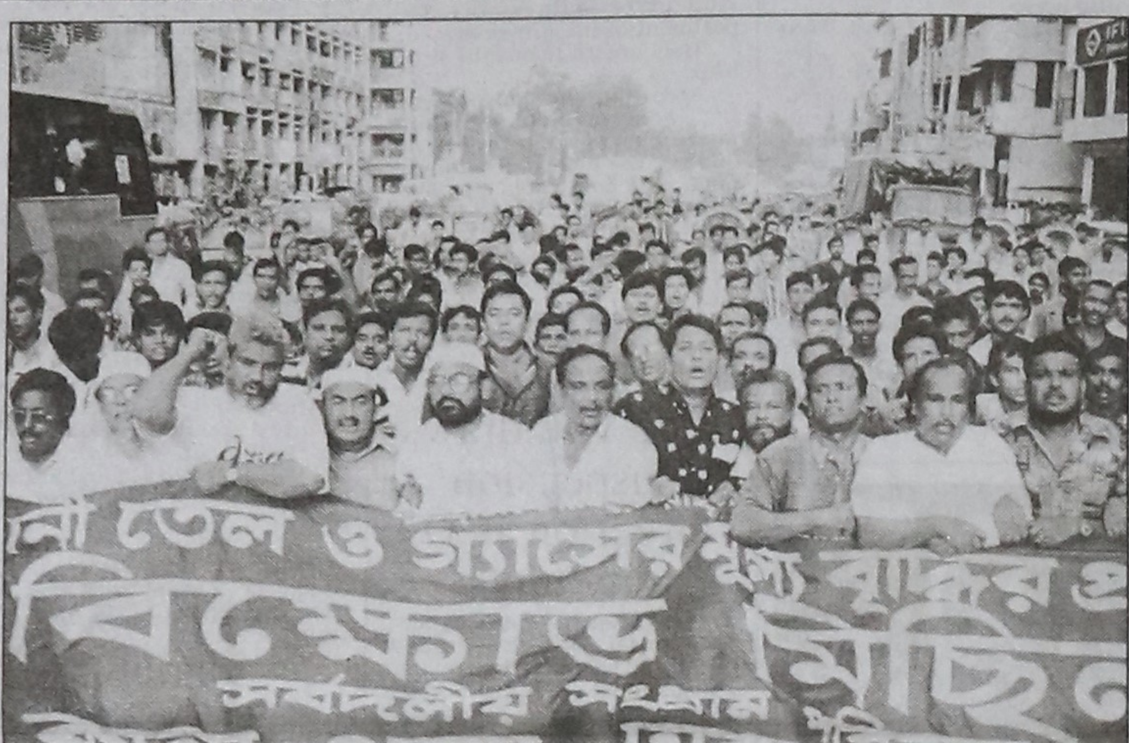
Dhaka City Unit of All-party Action Council staged a demonstration yesterday protesting price hike of petroleum products and gas.

Additional District Magistrate will act as Returning Officer.