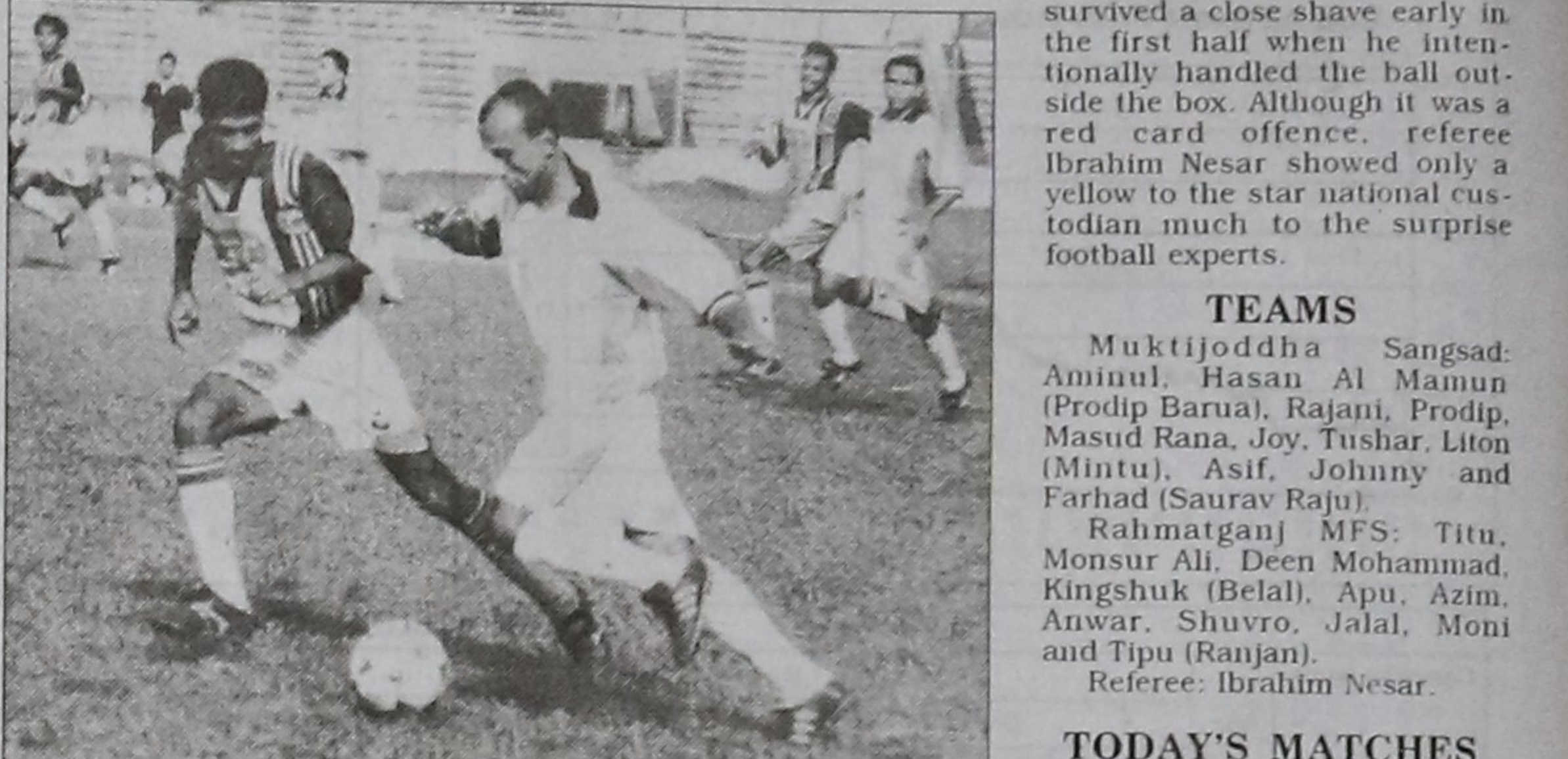
Action from yesterday's Federation Cup clash between Muktiyoddha and Rahmatganj at the Bangabandhu National Stadium.