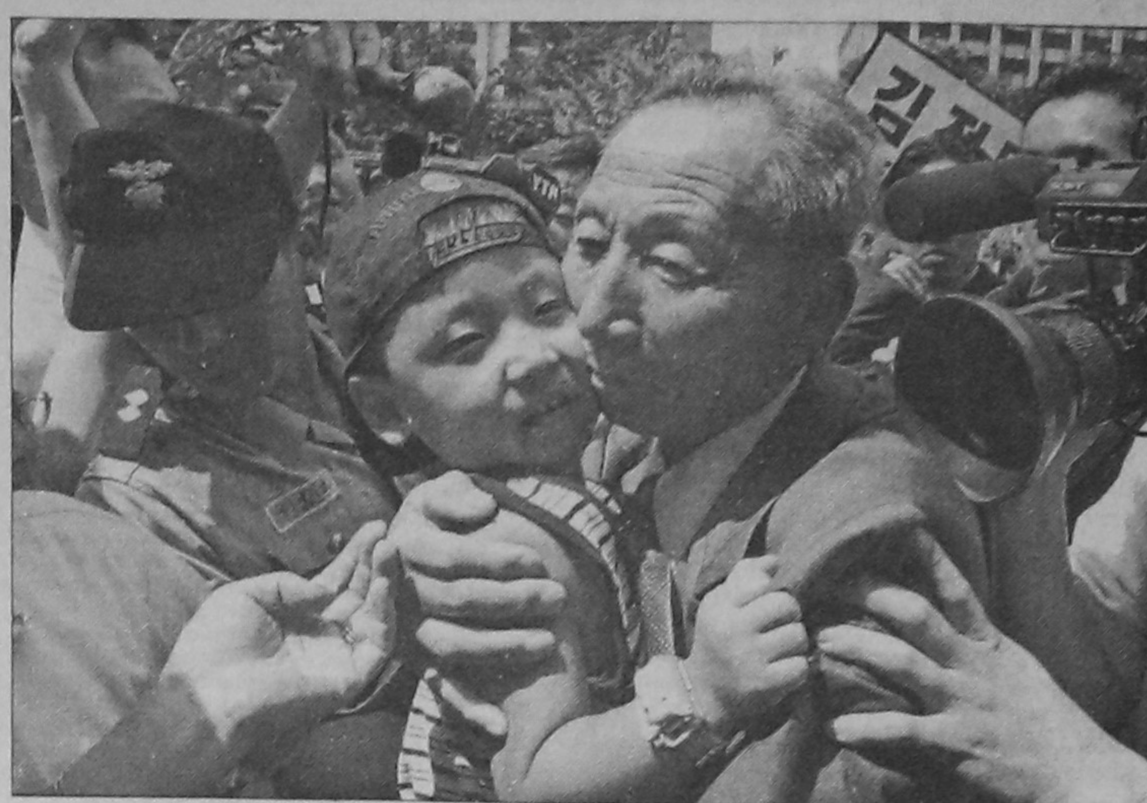
A North Korean man, visiting Seoul during the Inter-Korean exchange, hugs his grandson in Seoul yesterday. Both Koreans exchanged 100 people each for a four-day family reunions in their capitals in a rare event since the 1950-53 Korean conflict.

The flood situation was fast improving in the districts of Darang, Bongaigaon, Dhubri, Goalpara, Nalbari and Golaghat, the source said.