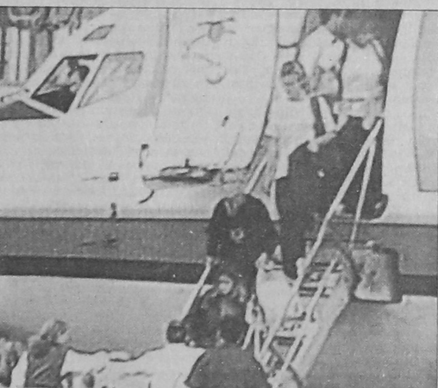
This image monitored from television shows passengers leaving a VASP airline Boeing 767 at the airport on Wednesday in Londrina, Brazil, where the jet made an emergency landing following a hijacking and robbery. Police say the hijackers got away with six million reales (four million USD) before forcing the pilots to land at Porecatu, where they escaped.

Passengers and crew were questioned by federal police before being released and allowed to continue their journeys.