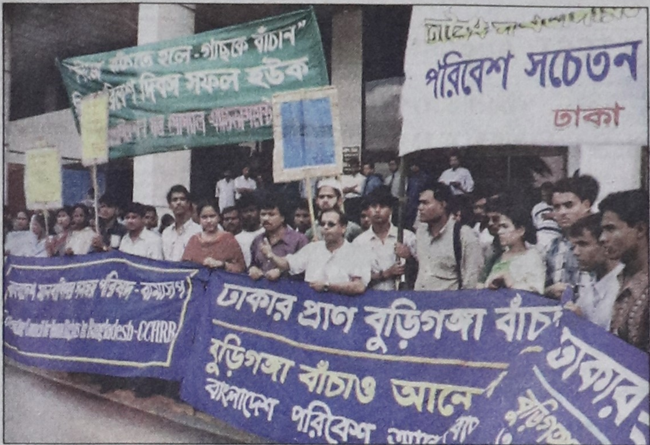
Students and teachers of Department of Sociology of Dhaka University along with different organisations staged a demonstration in front of the Sena Kalyan Sangstha in the city yesterday, protesting the encroachment by the Sena Kalyan Sangstha upon the Buriganga river.

The Sena Kalyan Sangstha (SKS) has officially admitted encroaching upon 600 feet by 160 feet of foreshore and 97 feet by 160 feet of main channel of the river Buriganga at Postogola in city but has refused to retreat from the foreshore area, according to sources.