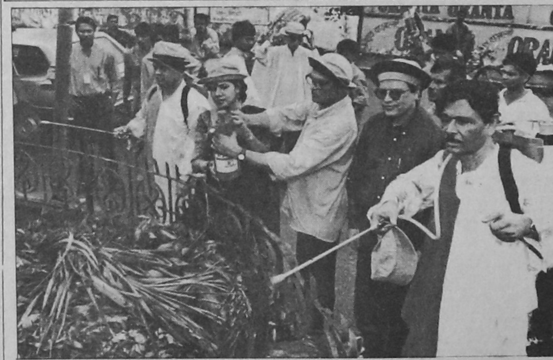
Bishwa Shahitya Kendra President and renowned TV personality Prof Abdullah Abu Sayeed and others spraying insecticide in the city yesterday. A citizens' body led by Prof Sayeed launched an awareness campaign about dengue infection and its prevention. Picture also shows (extreme L) magician Jewel Aich, actress Shireen Bakul, actor Khairul Alam Sabuj and economist Dr Atiur Rahman.

The bus was part of a convoy carrying security personnel to Srinagar, 300 kilometres to the north, ahead of Tuesday's Independence Day celebrations