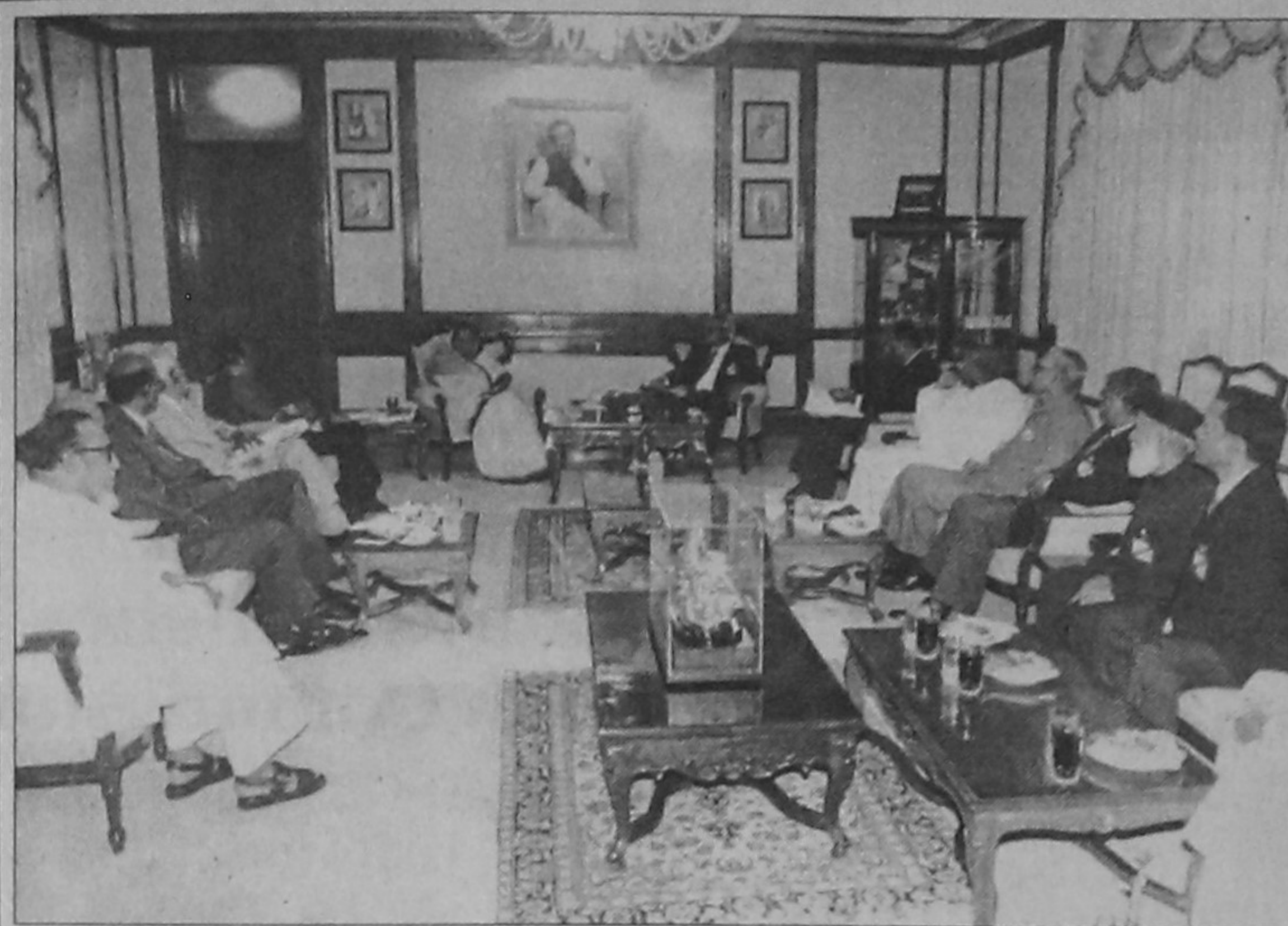
Senior lawyers including President and General Secretary of the Supreme Court Bar Association met Prime Minister Sheikh Hasina at the Ganabhaban yesterday.

Earlier in the morning session of the appeal hearings on the Bangabandhu Murder Case, the defence counsel told the court that the video cassette could not be admissible in the case as evidence as none of the producers or directors or any one who was present during the making was brought as witness.