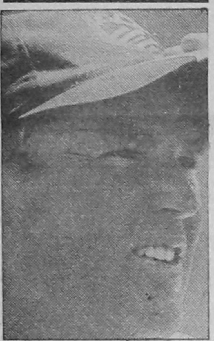
Shane Warne (Australian leg-spinner) The price of being an international cricketer, of being Shane Warne, is whatever I do - good or bad, big or small - ends up on the front and back pages of the papers.