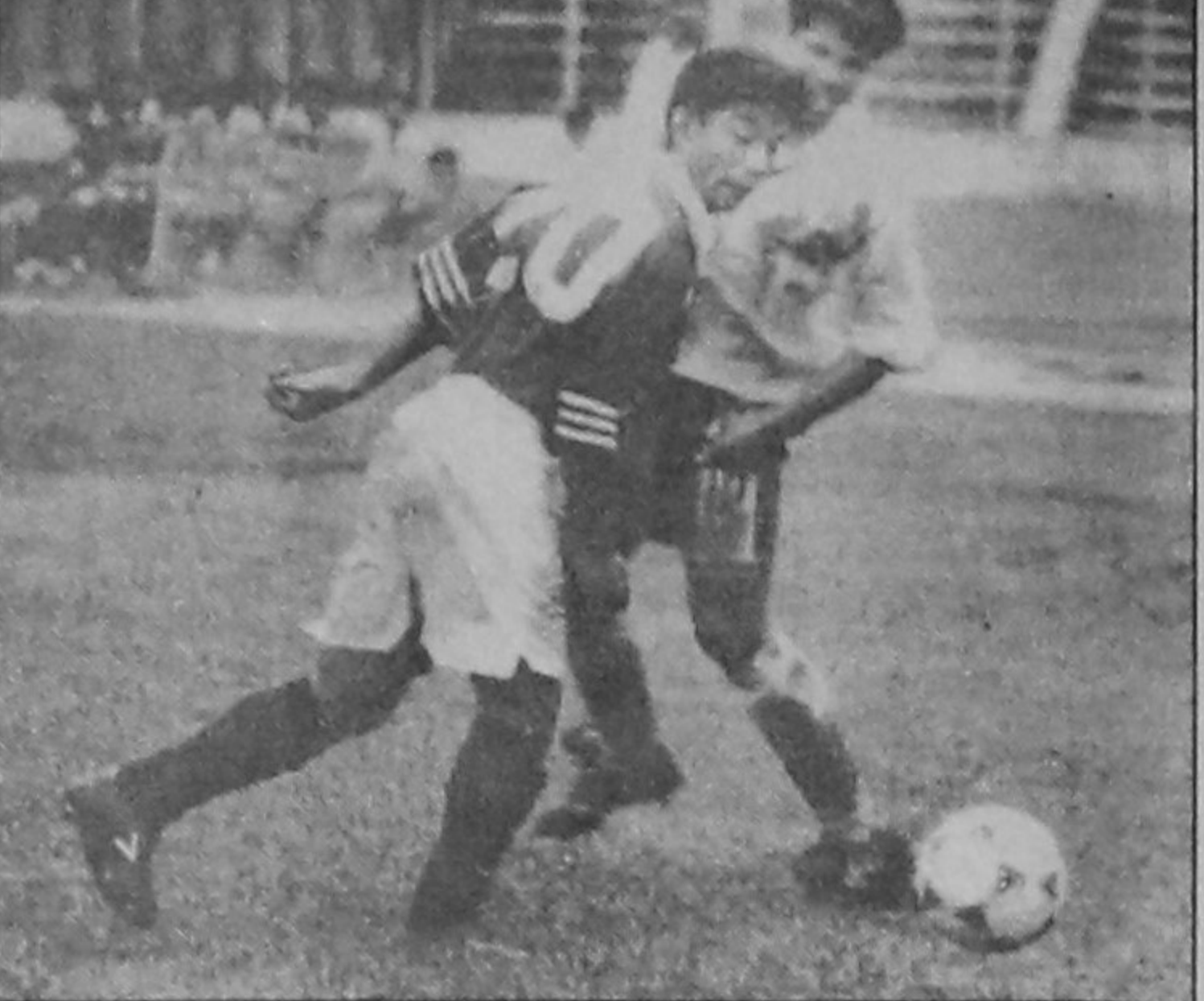
Players of BRTC and Victoria Sporting Club are in pursuit of the ball during their Federation Cup fixture at the Bangabandhu National Stadium yesterday.