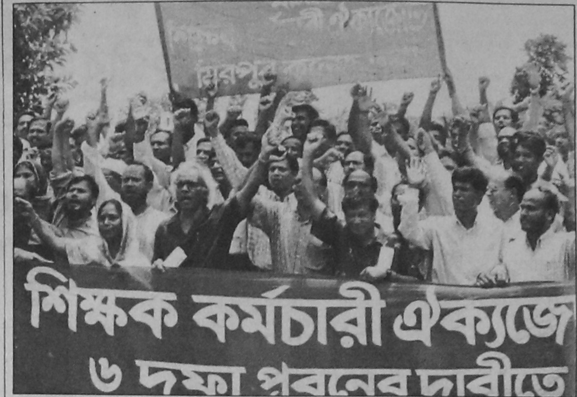
Teachers and employees of non-government schools and colleges staged a demonstration in the city yesterday to press their six-point demand including 100 per cent salary from public exchequer.

He said Hezb-ul Mujahideen gave India only a few days to respond to its demand for tripartite talks because they were concerned about their fighters on the ground in Kashmir.