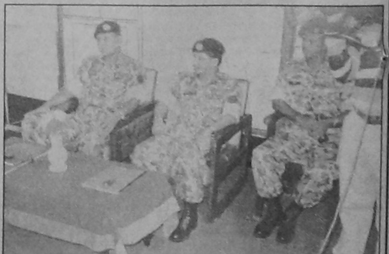
Bangladesh Rifles DG Major General Fazlur Rahman (1st from L) exchanging views with local journalists at 16 battalion headquarters during his visit to Cox's Bazar recently.

As part of its programme, the club officials planted different varieties of saplings in the premises of Yusuf Multipurpose High School in the town on Monday. Students and teachers of the schools, office bearers of the two clubs and local elite were present on the occasion.