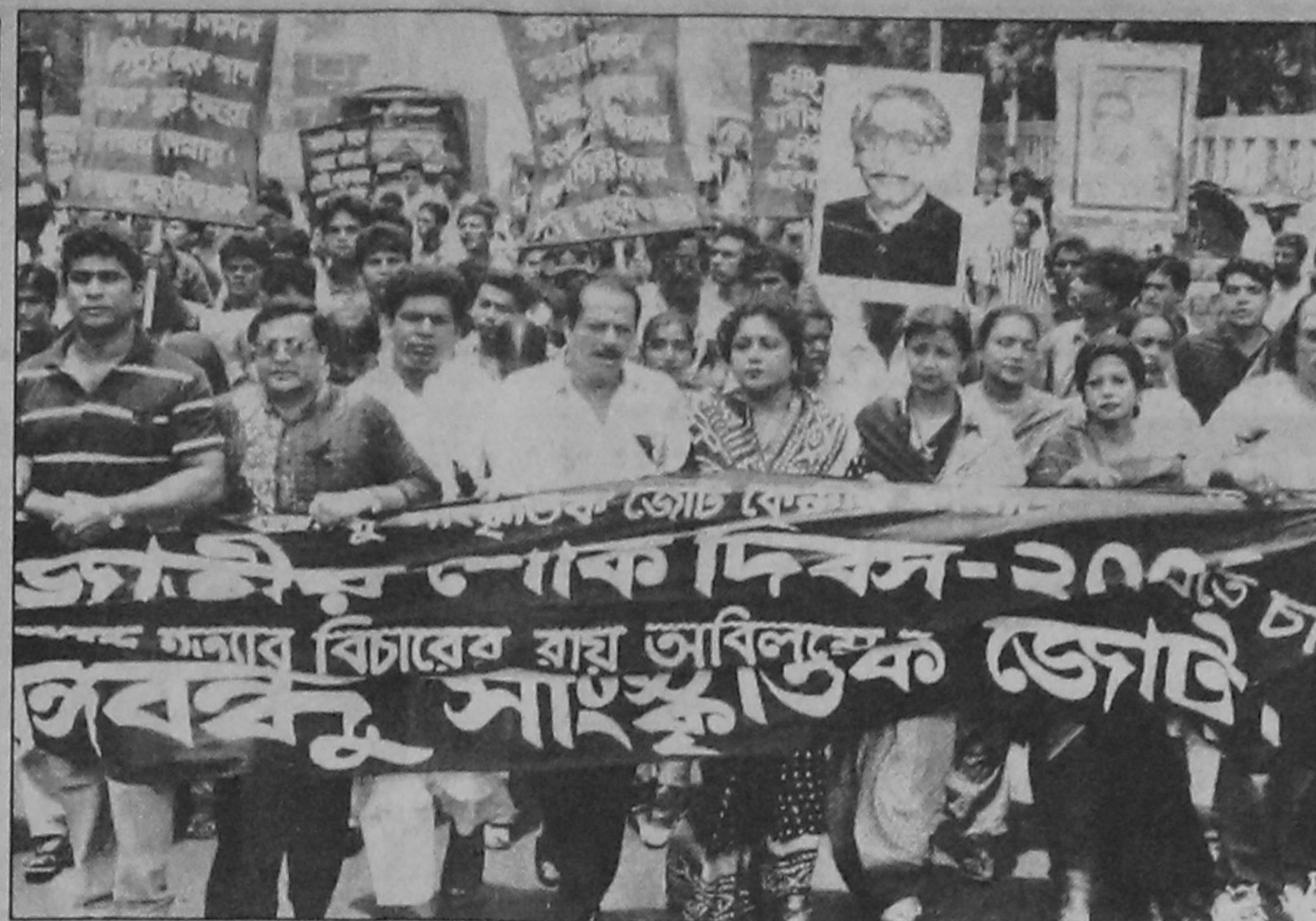
Bangabandhu Sangskritik Jote brought out a procession from in front of the Jatiya Press Club yesterday demanding the execution of the verdict in Bangabandhu Murder Case.

sent a letter to the Chief Election Commissioner demanding a probe into the alleged false registration of voters. Some 83 people were shown as voters with the same address - caretaker residence of Khaleda Zia.