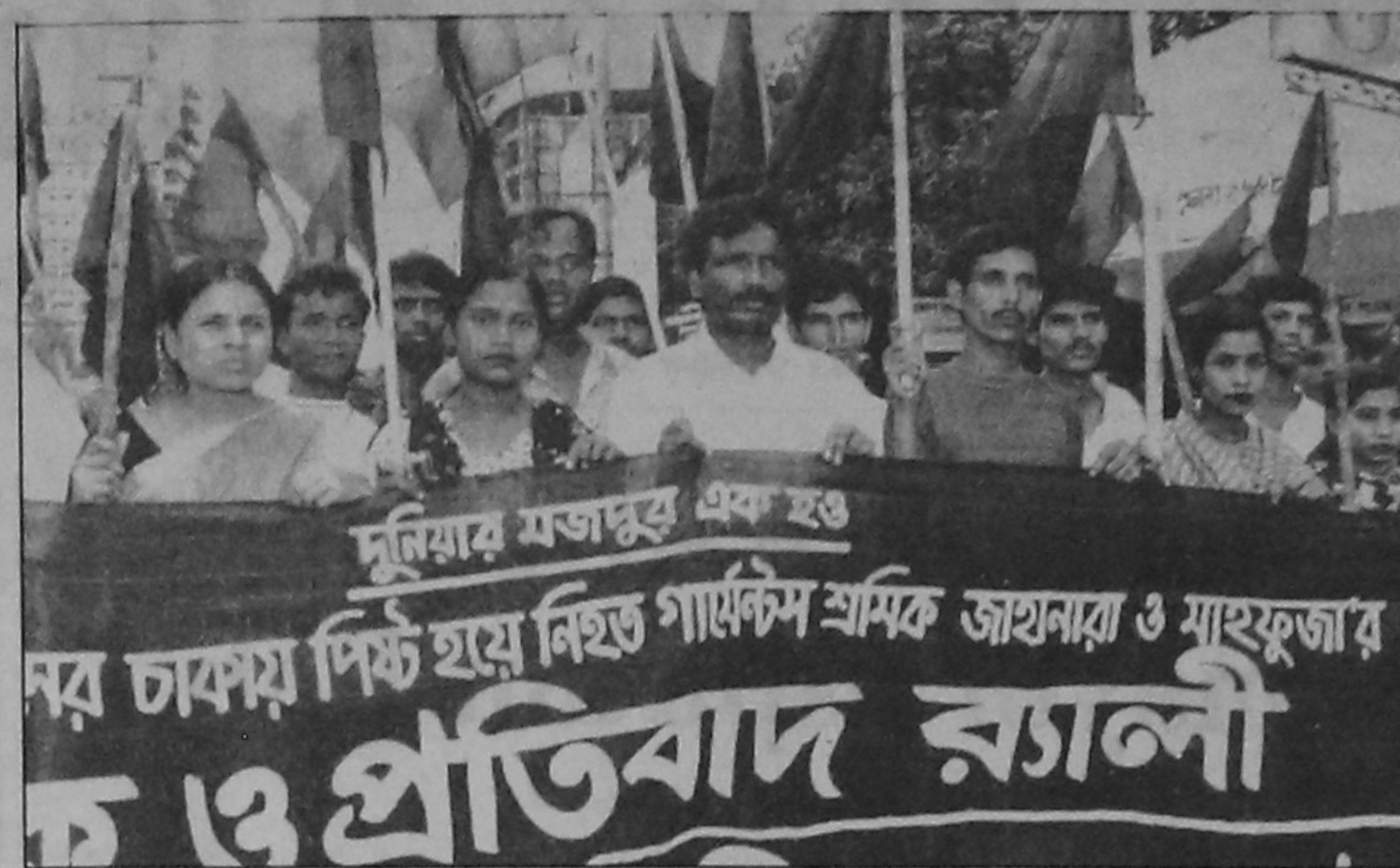
Garments workers held a black flag procession in the city yesterday to protest the death of two fellow workers who were knocked down and killed by a mini-bus on August 8 during the nationwide hartal called by the four-party alliance.