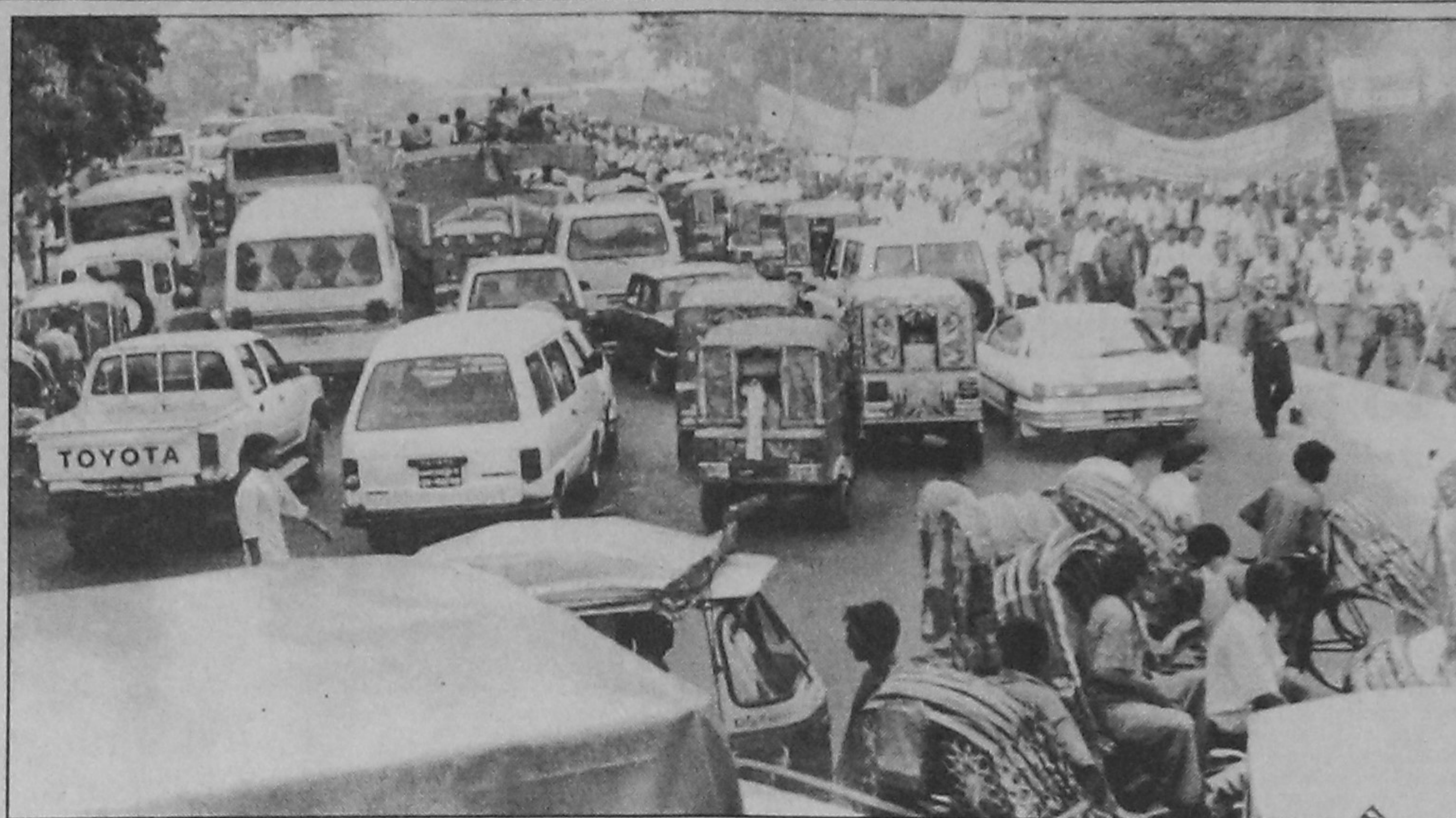
Bangladesh Diploma Engineering Students, Teachers and Professionals Action Committee brought out a procession in the city yesterday in support of their demands, but it created a severe traffic jam on the road in front of Jatiya Press Club.

Published by the Editor from Transcraft Ltd, 229, Tejgaon Industrial Area, Dhaka-1208 on behalf of Mediaword Ltd., 52 Motijheel C.A., Dhaka-1000. Editorial, News & Commercial Offices: 19 Karwan Bazar, Dhaka-1215. Telephone Numbers: 8124944, 8124955, 8124966, Fax: 8125155. GPO Box No: 3257, Cable: DAILYSTAR, DHAKA. Internet edition address: http://www.dailystarnews.com and Email address: dstar@bangla.net