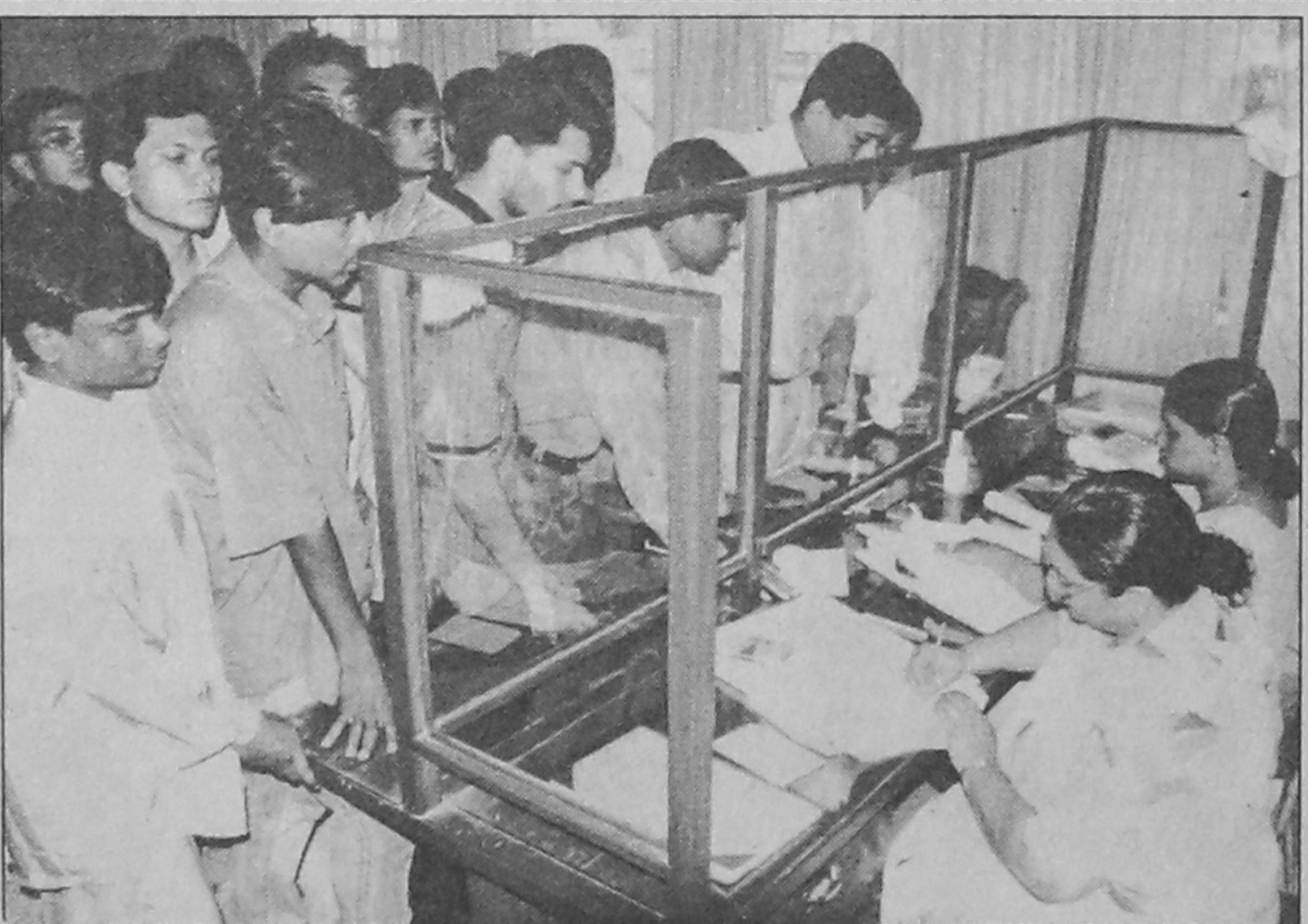
The queue at the Red Crescent Blood Bank at Asad Gate in the city yesterday testifies to the high demand for blood for dengue patients.