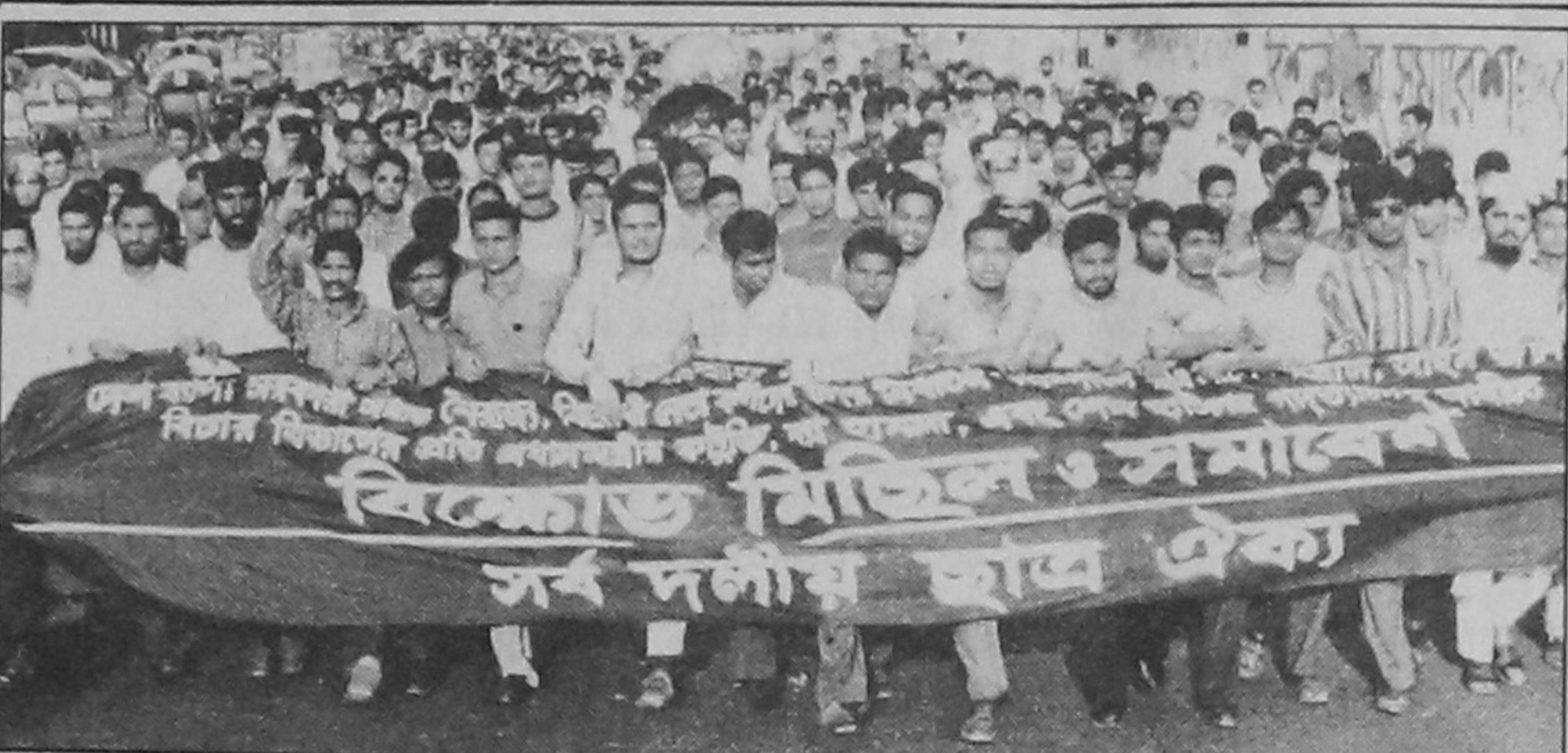
All Party Students' Unity brought out a procession in the city yesterday protesting state-sponsored terrorism, harassment of opposition activists and anti-people role of the government.

Senior officials of the WASA were present during the visit of the minister.