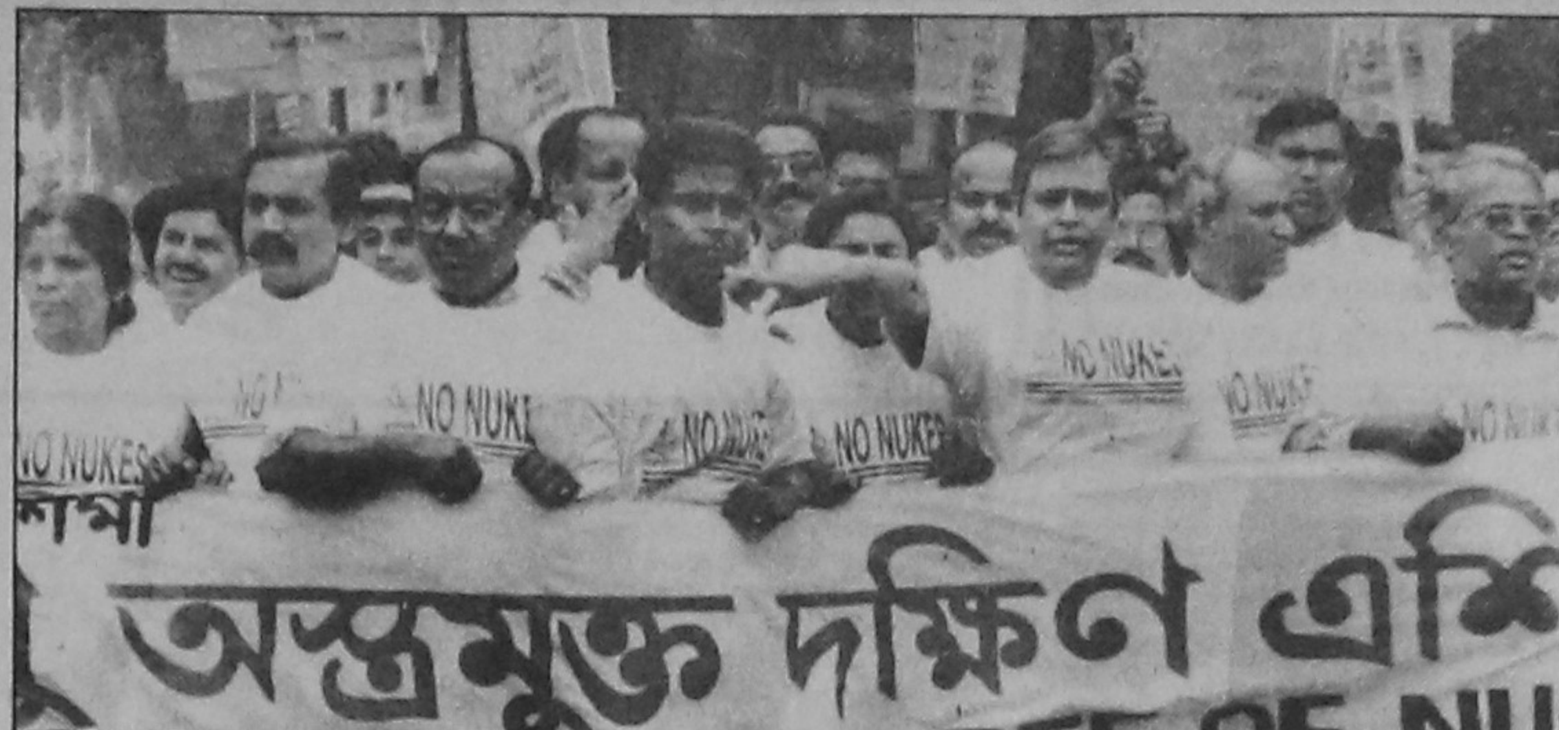
Bangladesh Medical Association brought out a procession in the city yesterday with a call for 'Nuclear Weapons-free South Asia.'

AL leadership is happy at the party position at grassroots levels following the elections in some tiers of local governments in which opposition parties did not participate, one source noted.