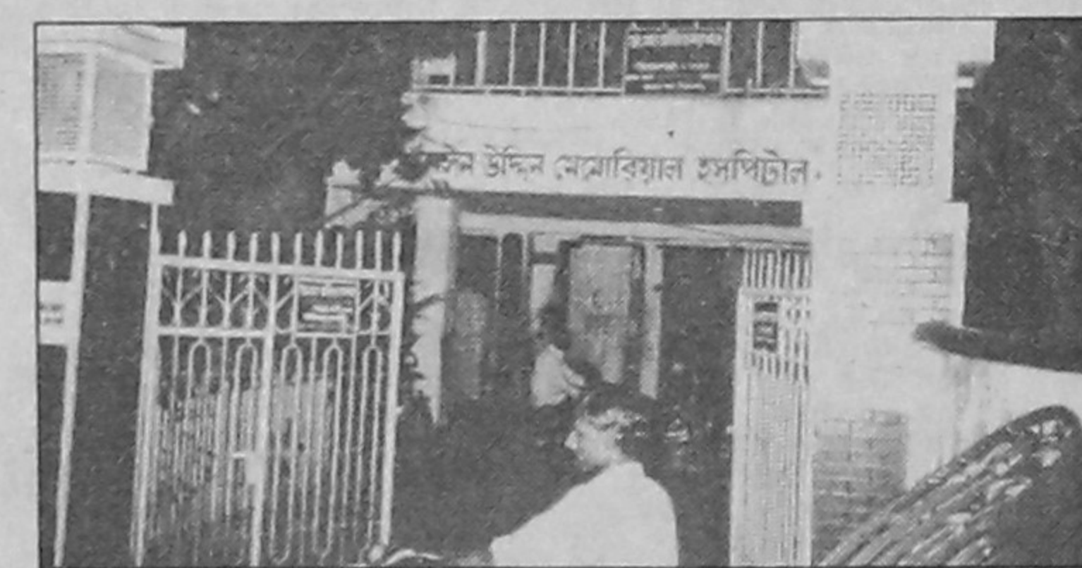
A private clinic in Sirajganj town

In this perspective, private clinics are established and gained popularity. These clinics also become overcrowded, commercially viable within a very short period. This has led to establishment of more new clinics. As a result a mushroom growth of clinics took place. The private clinics are increasing in number every year. The office of the civil surgeon could not say the actual number of private clinics and hospitals working in the town and other upazilas. The number will be over 100 said an official. These private hospitals and clinics are mainly surgery-based. But most of those have no well-equipped operation theatre. In Sirajganj Hospital, Moven Uddin Memorial Hospital and Clinic, Poli Clinic are the few exceptions which are more or less well-equipped and well-managed with modern operation theatres. Others have no cardiac monitor or pulse oxymeter. Situation of cleanliness and sanitation is not satisfactory in most of the clinics. Patients are kept in corridors and verandahs, raising temporary curtains of cloth and hardboards. The rooms are not cleared properly. Bed smells evolve from the rooms. When number of patients increases sufferings of patients multiply.