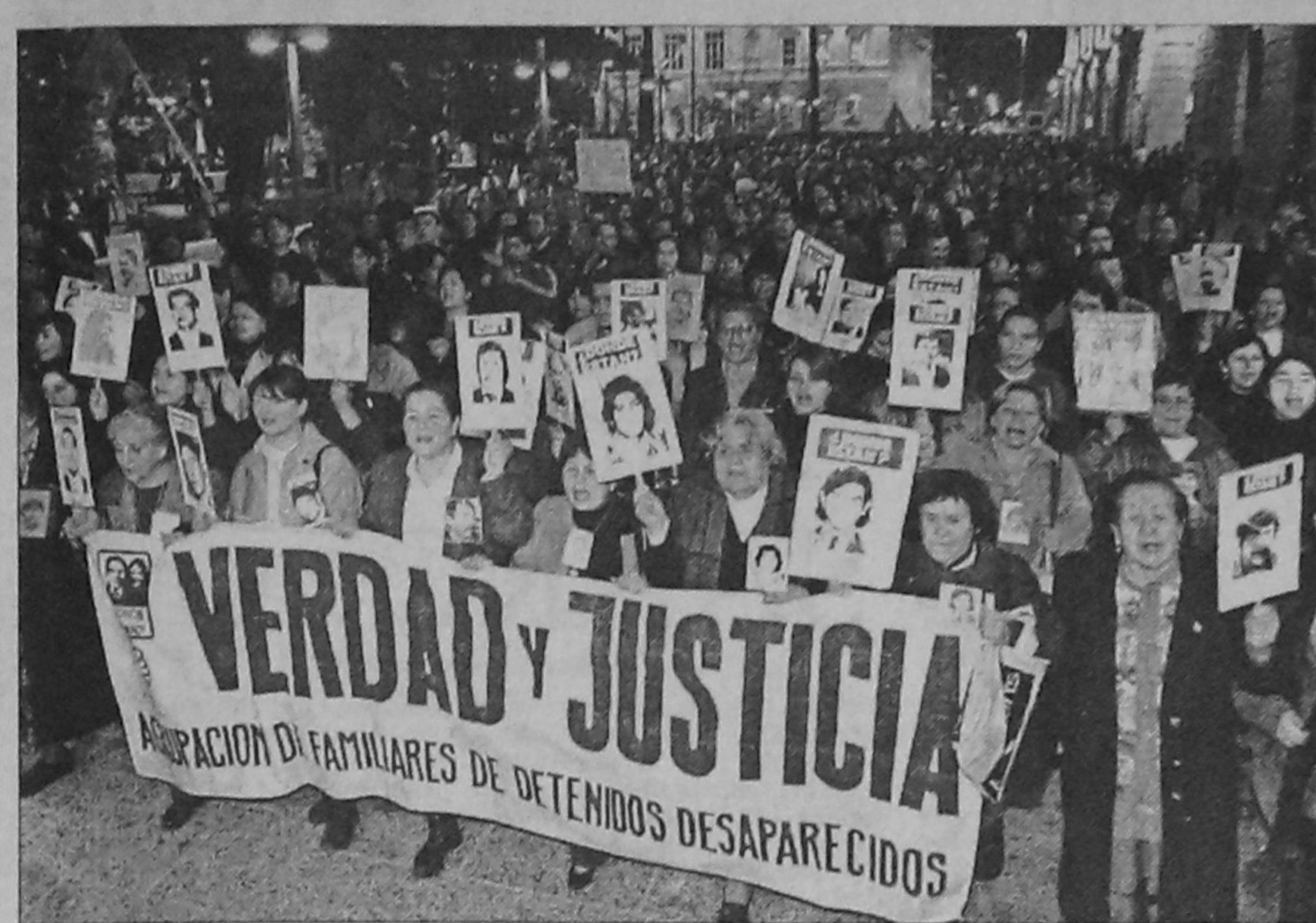
Relatives of victims of the Pinochet regime and members of human rights groups celebrate in Santiago on Tuesday. The demonstrators celebrated the Supreme Court's decision to uphold a ruling to strip former dictator Gen. Augusto Pinochet of his immunity from prosecution. The sign reads, "truth and justice."

The aide, Mohamed Ismail, was fetched from a ferry by unknown armed men and escorted out of town, an AFP correspondent witnessed.