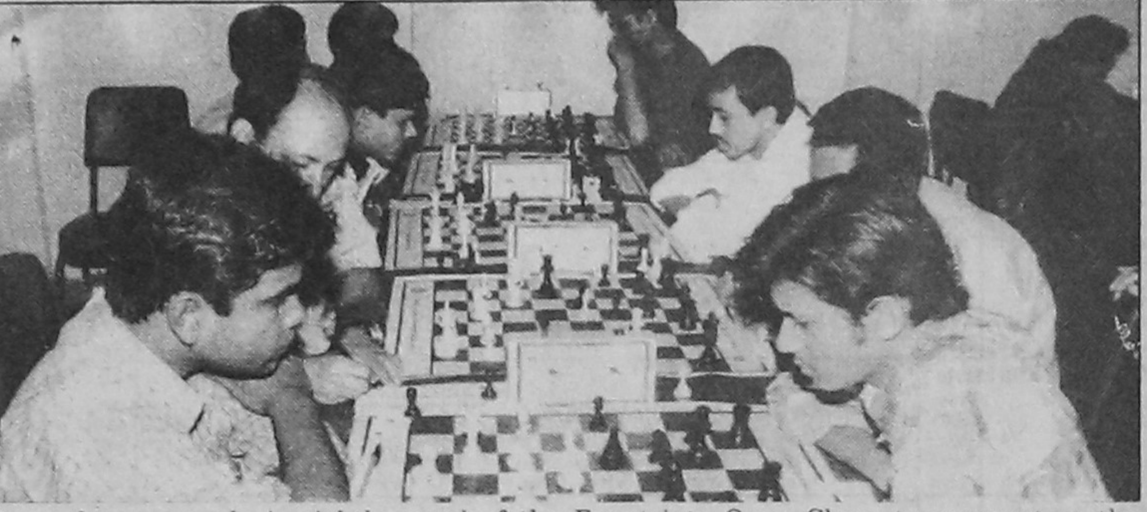
Scene from yesterday's eighth round of the Expatriate Open Chess tournament at the NSC chess room. — Star photo