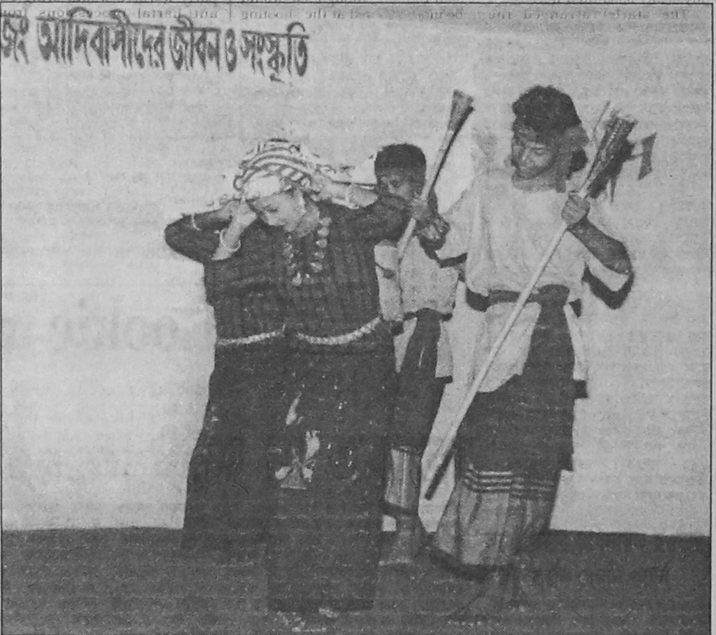
Tribals performing Kamlapara dance.

NETRAKONA, Aug 7: Birishiri is a small rural centre near Durgapur upazila headquarters. It is the centre of cultural, religious and educational activities of tribal Garos and Hajongs.