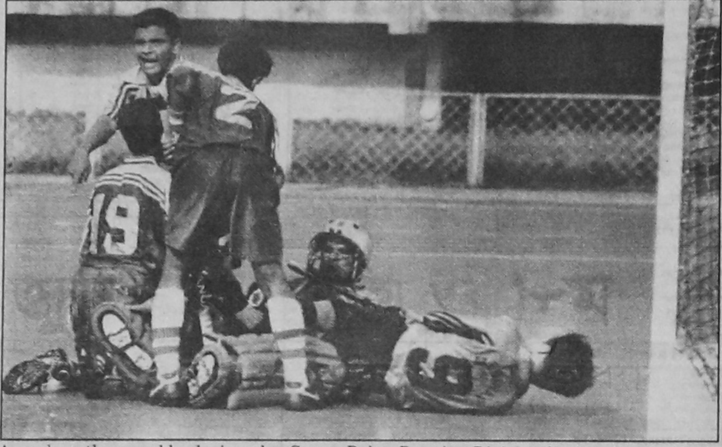
A goalmouth scramble during the Green Delta Premier Division hockey league clash between Mariner Youngs Club and Bangladesh Sporting Club at the Maulana Bhasani Stadium yesterday.