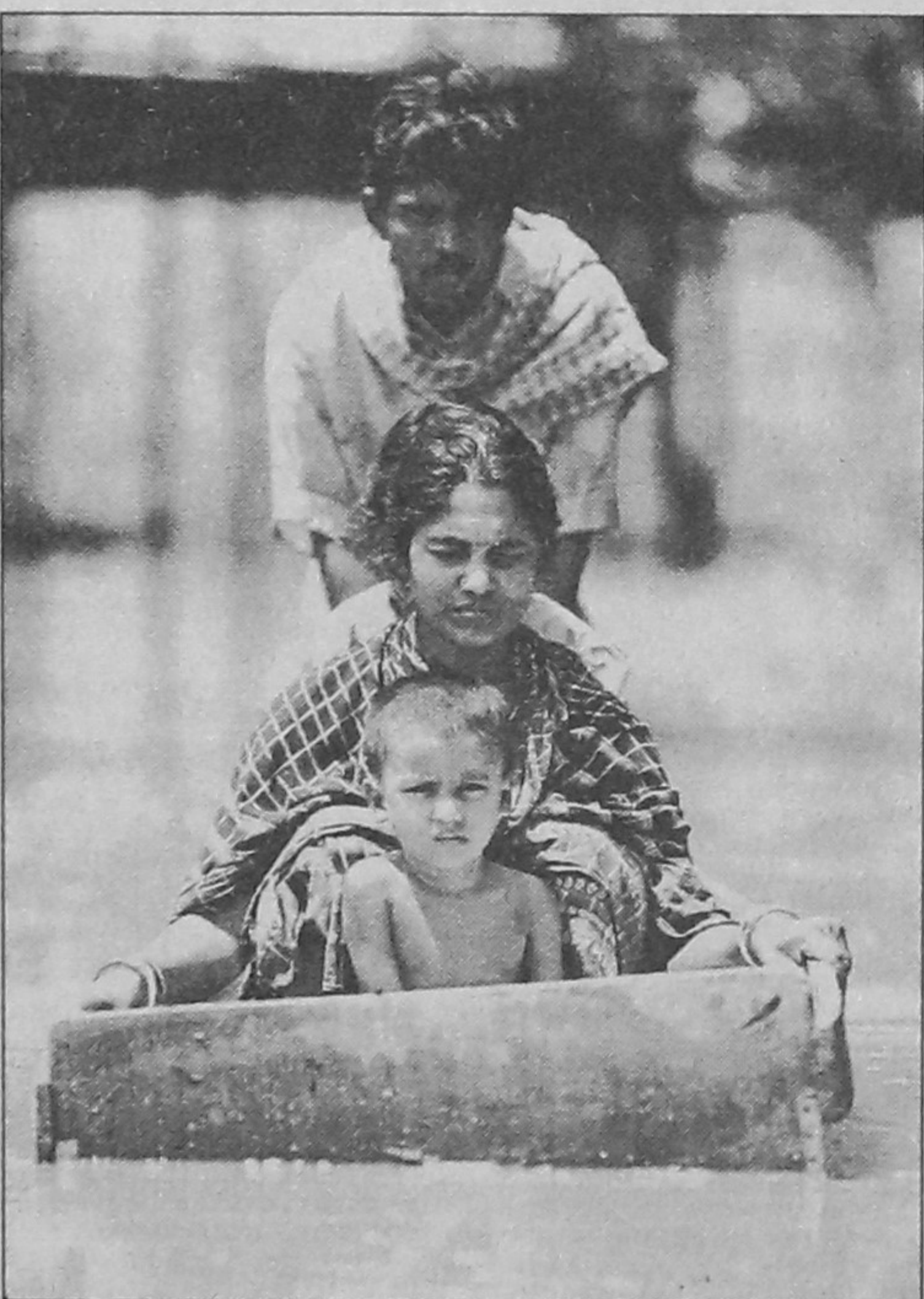
A villager pushes his family through a waterlogged area in a small hand-made boat in Shantipur in Nadia district, some 100 kilometres north of Calcutta on Saturday. Over one million people have been homeless by flash floods caused by monsoon downpour last week which also damaged rice and jute crops.

Coal is imported from the hilly region of Meghalaya. It is loaded there. Most of the times, officials of the PSI company cannot visit the area from where the coal consignment is loaded due to security and other reasons. It takes about one and a half to two months to complete the formalities from loading to unloading.