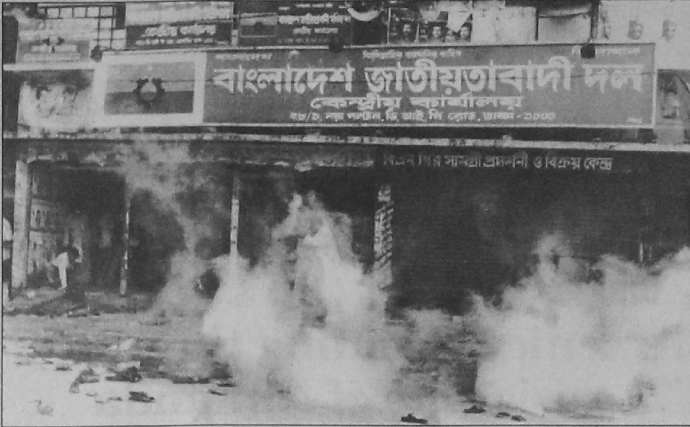
People try to escape the blinding smoke screen after police fired teargas canisters to disperse an opposition rally held at Naya Paltan in the city yesterday.