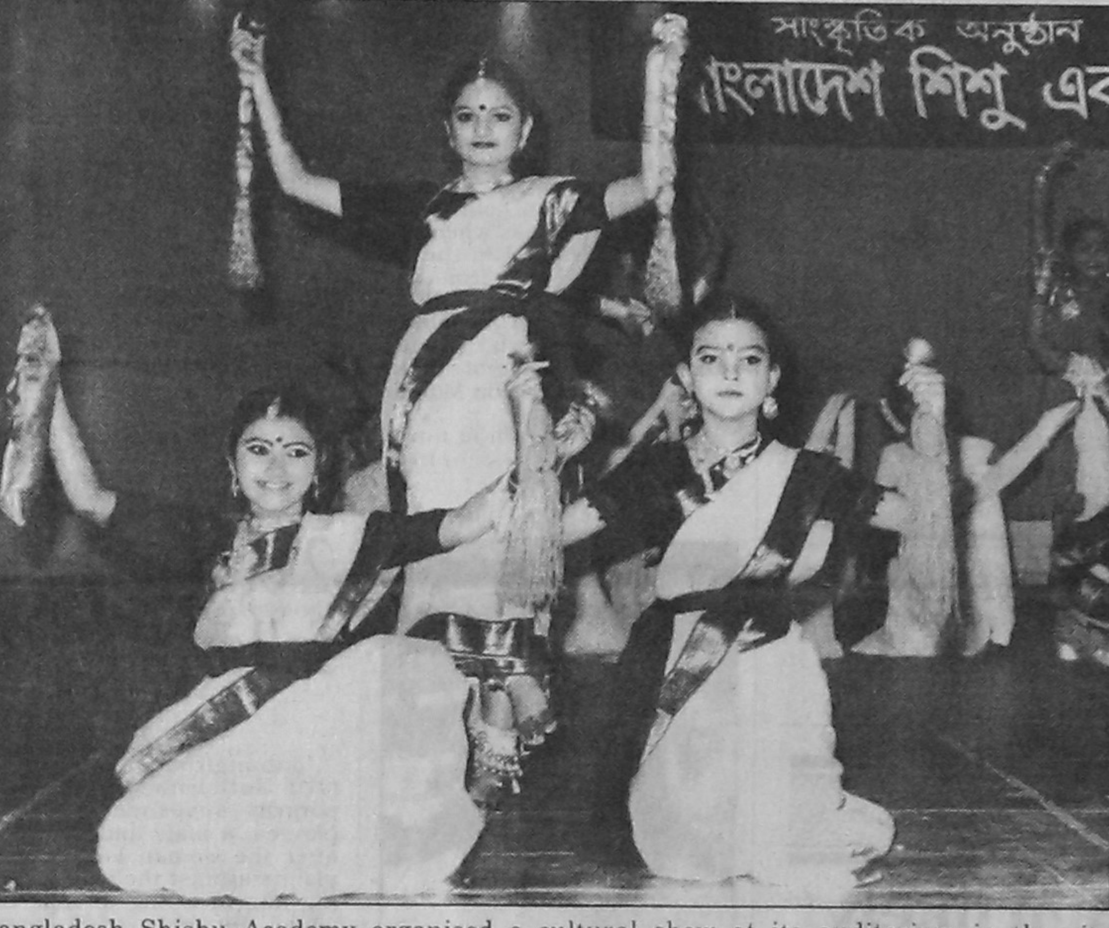
Bangladesh Shishu Academy organised a cultural show at its auditorium in the city yesterday to mark the death anniversary of poet Rabindranath Tagore.

By Staff Correspondent Police at Zia International Airport yesterday arrested 34 people including five women from the canopy and car park areas for creating trouble to incoming passengers. Seventy people including these 34 were arrested in the last four days on charges of dragging luggage from the passengers and bothering them in various other ways, police said. These elements known as tana party particularly target those returning home. Sometimes they take away luggage from passengers. In reply to a question, a police official said the drive would continue till the situation improved. Earlier, press reports said that a section of the taxi drivers at the airport was engaged in looting valuables from passengers on their way home. Asked if police would conduct any drive against them to improve the image of ZIA, a senior police official said they did not get any specific allegation in this regard.