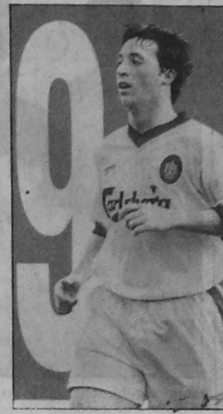
went two knee operations. That followed the previous season of FA bans, controversy and more injury. Somewhere along the line, Fowler has lost two years of his career, and he wants them back. He said: "I've had a very good

career so far, so last season was very disappointing. But that can happen in this game and I've just got to get on with it. "But I'm confident in my ability, and I know what I can do. But I know it's going to be tough after all my injury problems." "Even though I didn't get a game for England in Euro 2000, I trained with the squad all the time and that must have helped my attempts for full fitness and sharpness." Fowler, who will be captain until Jamie Redknapp returns around February, relishes the fight he has on his hands, although he added: "I don't think I have to prove anything to anybody." And it is the competition generated by boss Gerard Houllier's 50million outlay that is inspiring Fowler. He said: "If you are not playing well then you know you are not going to be playing. That sort of competition keeps everyone on their toes." "The lads who have come in this summer are determined to impress so it's going to be tough to get yourself back into the side. The competition is beneficial to Liverpool, and that's all that really matters." He added: "I'm no bigger than anyone else here, and if it happens to me sitting on the bench then you have to accept it because these days it's not all about 11 players, there's 25 top stars here now." "If I'm not doing my job then the gaffer has every right to leave me sitting on the bench. He'll have every right not to play me."