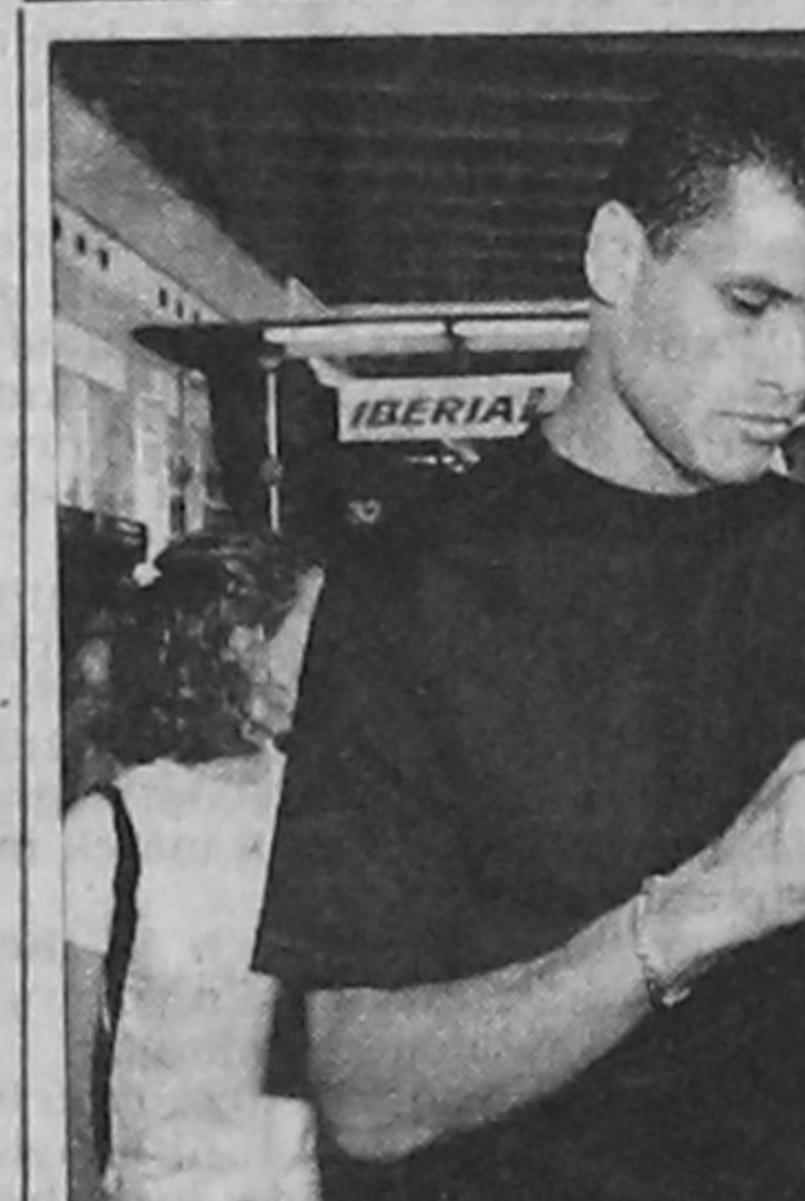
Superstar Rivaldo obliging some tiny autograph hunters at Barcelona's Prat Airport on August 2 prior to his departure for Amsterdam to join his Barcelona clubmates who are camping in Honderloo.

two top Spanish clubs offered Chelsea close to 20million (30million dollars) for Tore Andre Flo. "The offers were rejected on the spot. Chelsea said that selling Flo was not an issue." "I am told he is as big as Alan Shearer in Saudi, and he has looked very smart in training."