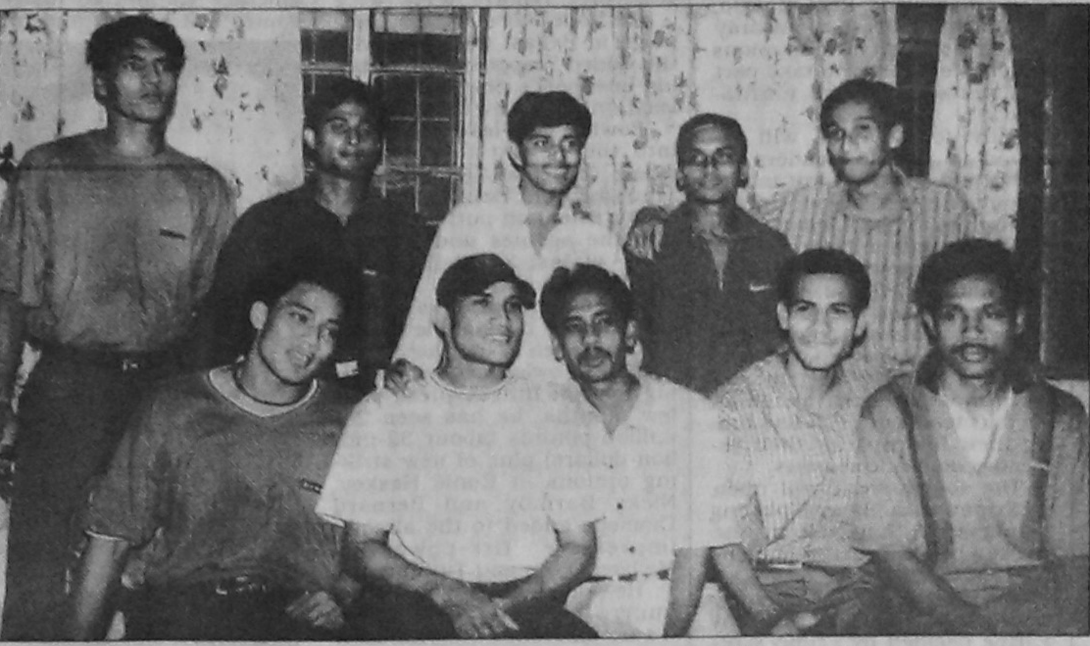
A happy bunch of Muktijoddha Sangsad Krira Chakra players who completed their transfers yesterday.

"I have spoken to Warne a couple of times and he knows the situation and knows there is going to be talk about the whole thing."