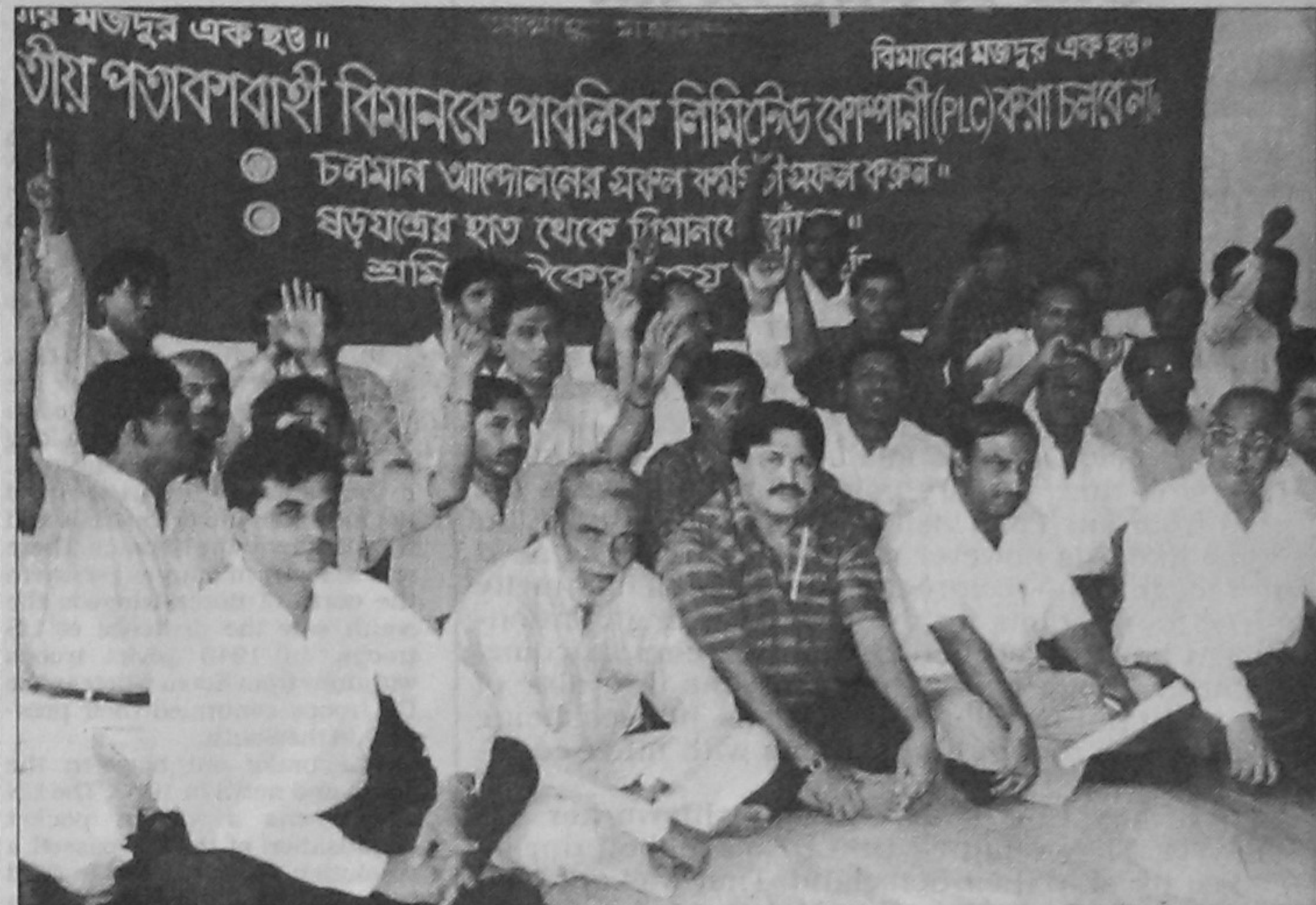
Sramik Karmachari Oikya Parishad (SKOP) of Biman staged a token hunger strike inside Balaka Bhaban yesterday protesting government move to turn Biman into a Public Limited Company.

Moderate to heavy rainfall in most places with very heavy