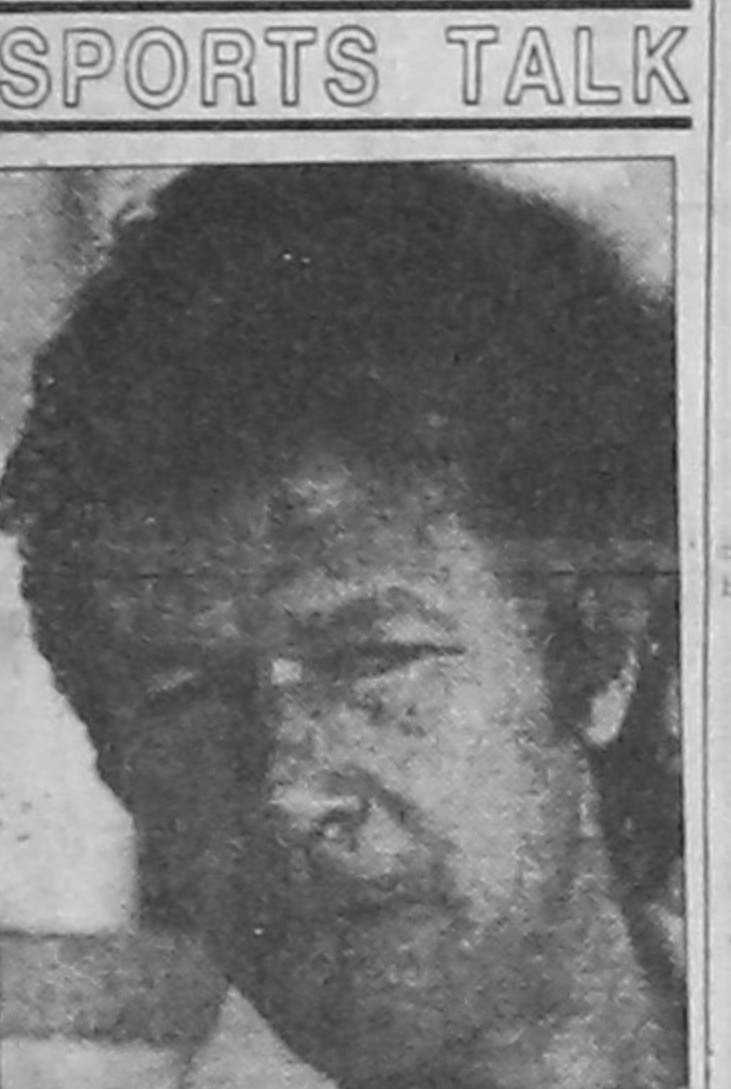
Imran Khan (Pakistani cricket legend) When I was part of the ICC I witnessed a divide between white and coloured cricket-playing nations.