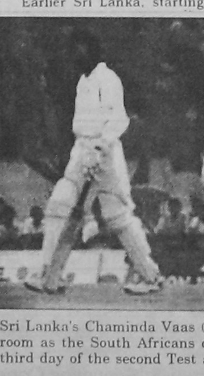
Sri Lanka's Chaminda Vaas (L) walks back to the dressing room as the South Africans celebrate his dismissal on the third day of the second Test at Kandy yesterday.