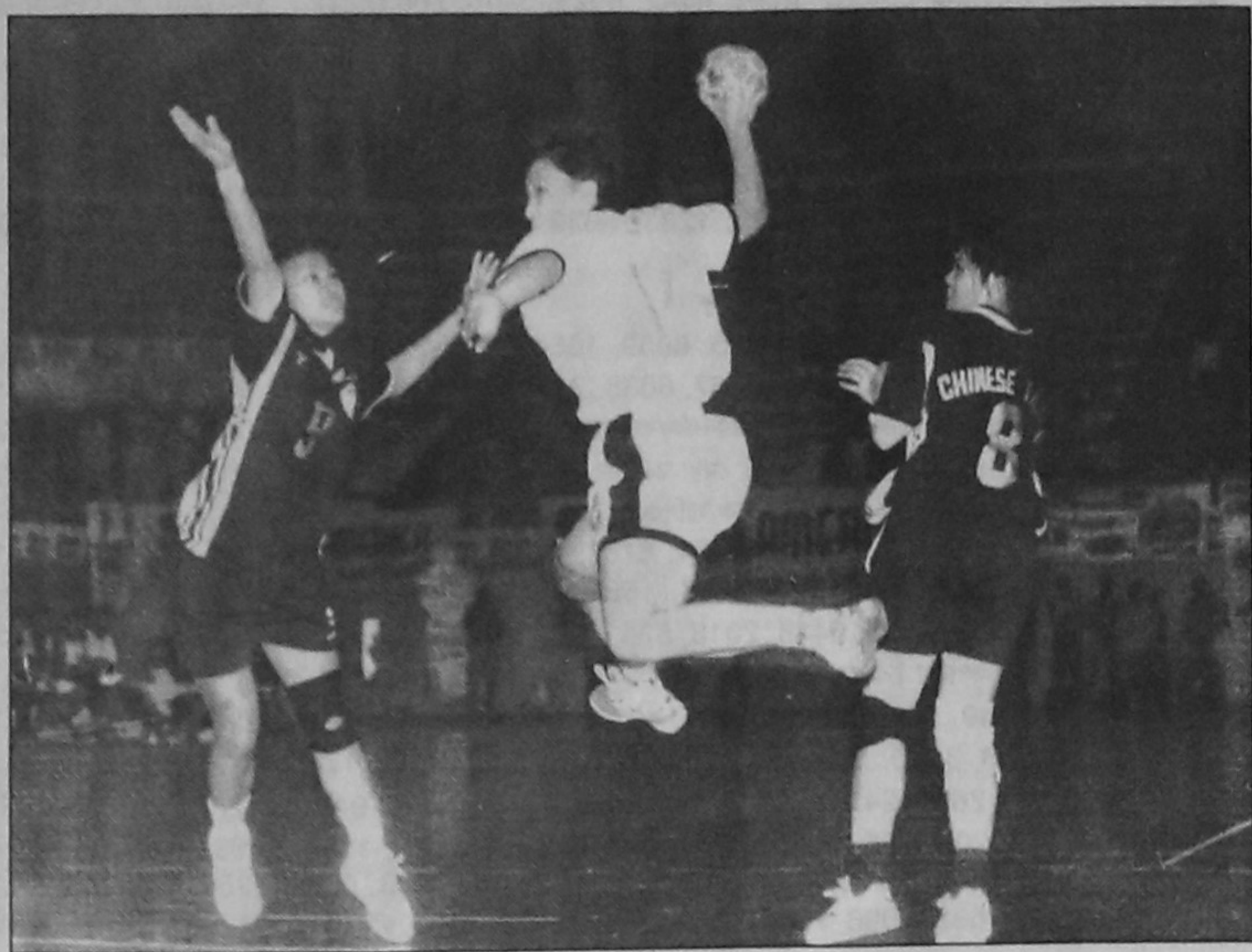
Action from yesterday's second semifinal of the Soya America Sixth Asian Women Juniors Handball Championship between China and Chinese Taipei at the Shaheed Suhrawardi National Indoor Stadium in Mirpur.